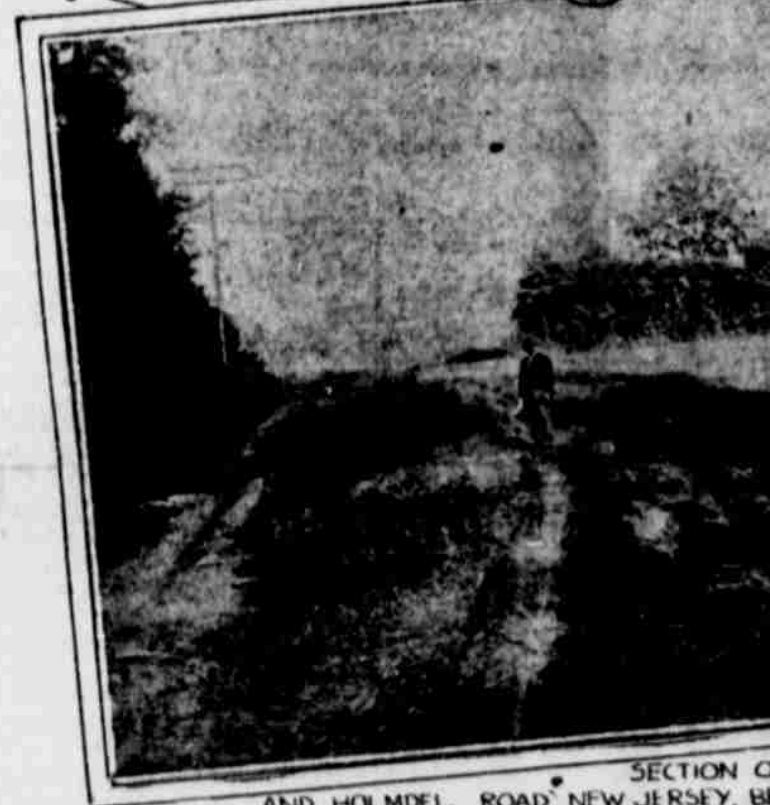
SECTION OF RED BANK AND HOLMDEL ROAD, NEW JERSEY, BEFORE IMPROVEMENT.