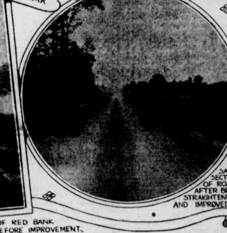
SAME SECTION OF ROAD AFTER BEING STRAIGHTENED AND IMPROVED.