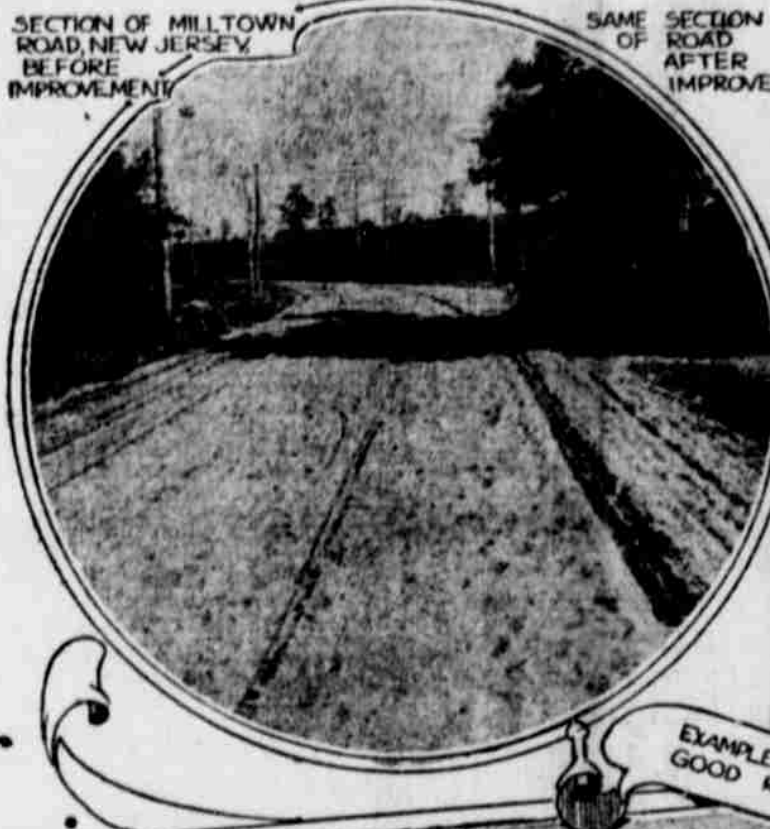
SECTION OF MILLTOWN ROAD, NEW JERSEY, BEFORE IMPROVEMENT.