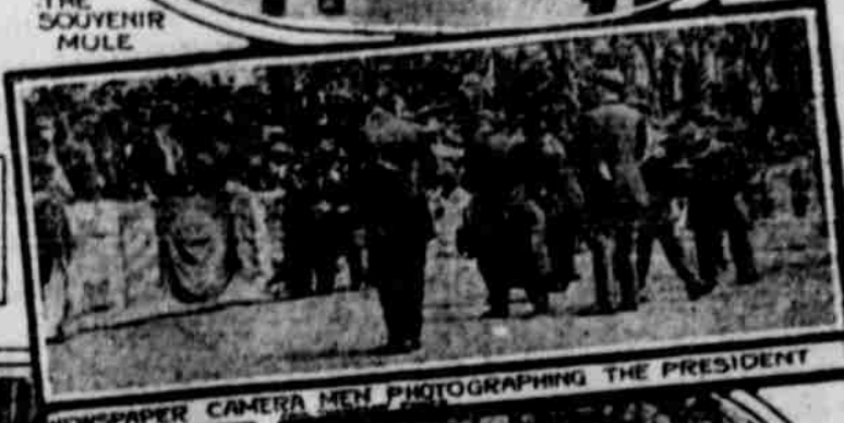
NEWSPAPER CAMERA MEN PHOTOGRAPHING THE PRESIDENT