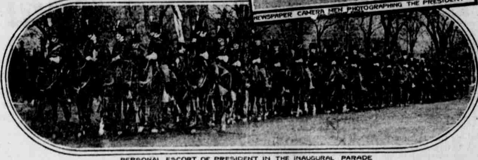
PERSONAL ESCORT OF PRESIDENT IN THE INAUGURAL PARADE