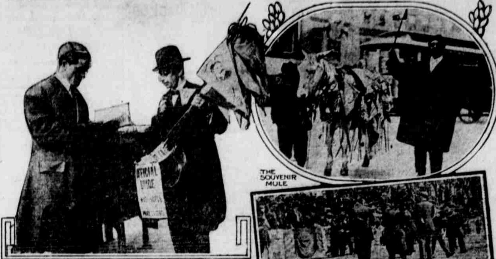
FAKIR ON PENNSYLVANIA AVENUE