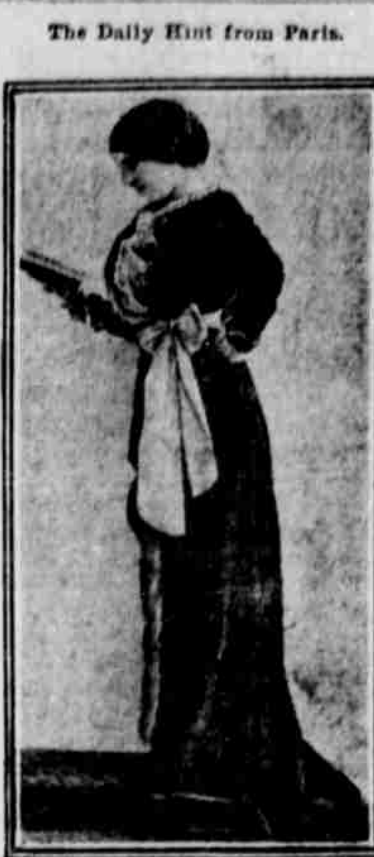
A pretty touch to this black velvet gown is the yellow sash with its well placed loops and ends.