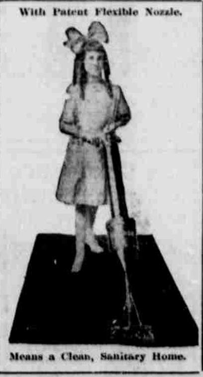
Means a Clean, Sanitary Home.

One of these $10 National Vacuum Cleaners and the Daily Mail Tribune for two months, both for $5.00 cash in advance, as a two months' subscription must accompany each order. In case of old subscribers, two months will be added to your present subscription and with new subscribers will be started at once.