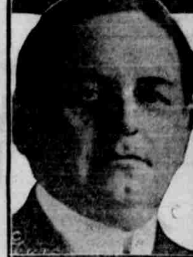
SENATOR JOHN W. KERN REP. OSCAR W. UNDERWOOD