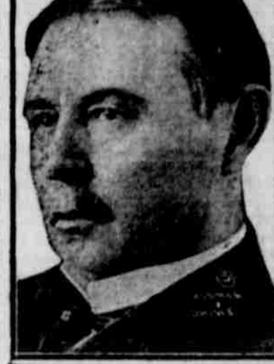
SPEAKER CHAMP CLARK SENATOR F. M. SIMMONS