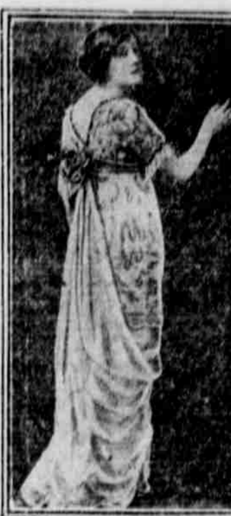
Russian times are combined charmingly with drapery in some of the newest evening gown models. Shown here is a white chiffon dress with green. The trim is embroidered in gold Chinese motifs. The skirt drape is fastened over it. Hat velvet belt caught at neck with flowers. - MAISON MARTIN