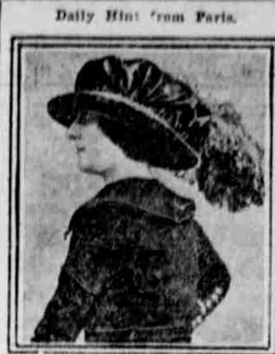
Daily Hints from Paris. Bold outlines are used for many of the plush covered midwinter hats. The one shown here is trimmed with a single long black feather, posed in the latest fashion—Maison Vert.