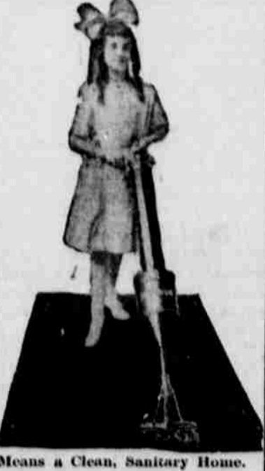
Means a Clean, Sanitary Home.