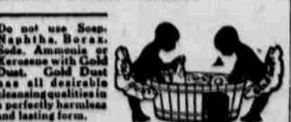
"Let the GOLD DUST TWINS do your work"

Don't use up all your time and strength trying to keep things clean; use Gold Dust everywhere you can—in all your household cleaning—and let it do the work. It works so quickly and thoroughly that really it makes cleaning a pleasure instead of a task. It makes home "sweet" home.