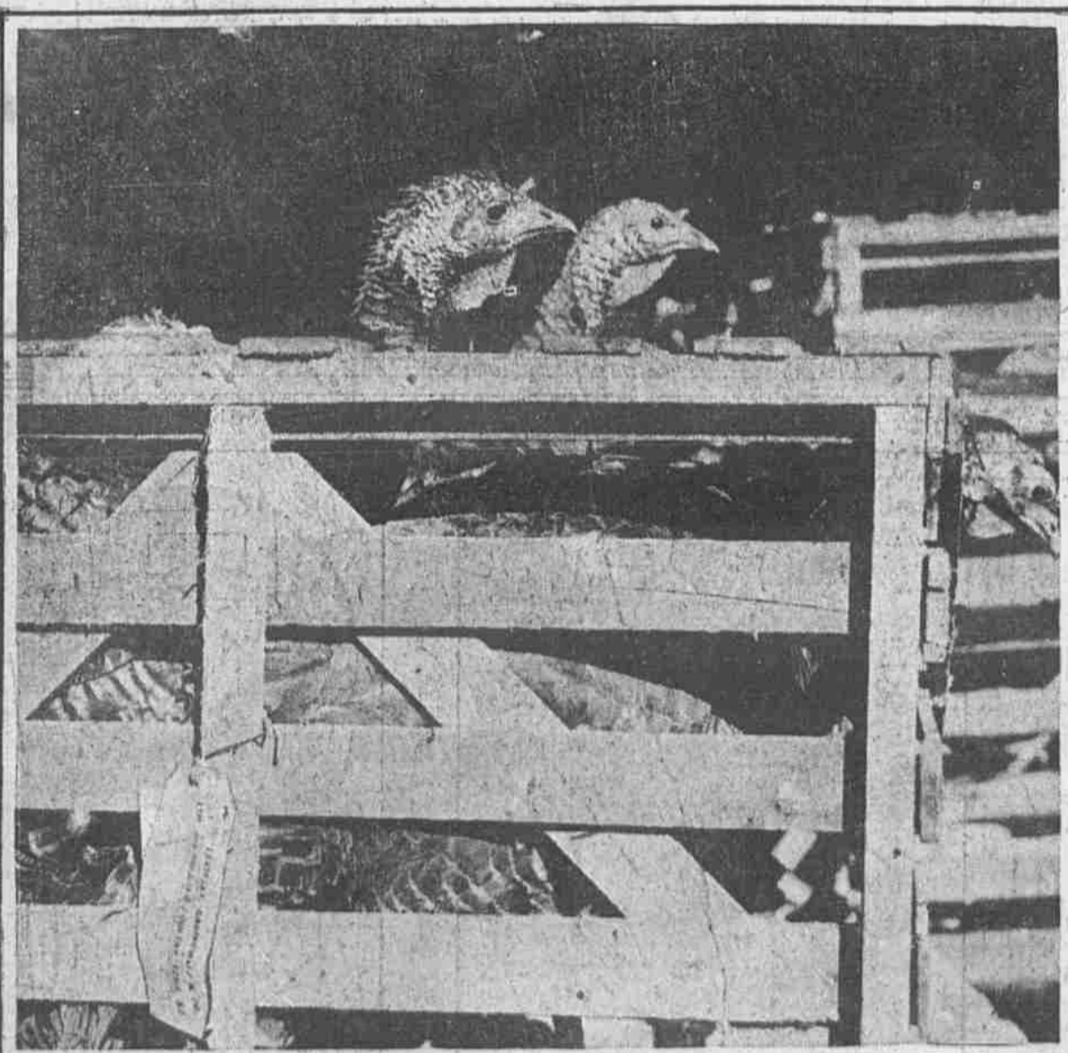
A CRATE OF FINE GOBBLERS

It is estimated that 100,000 turkeys arrived in the city yesterday. Wells-Fargo Express Company wagons are shown here unloading several crates at 24th and Chestnut streets. Price range from 28 to 32 cents per pound.