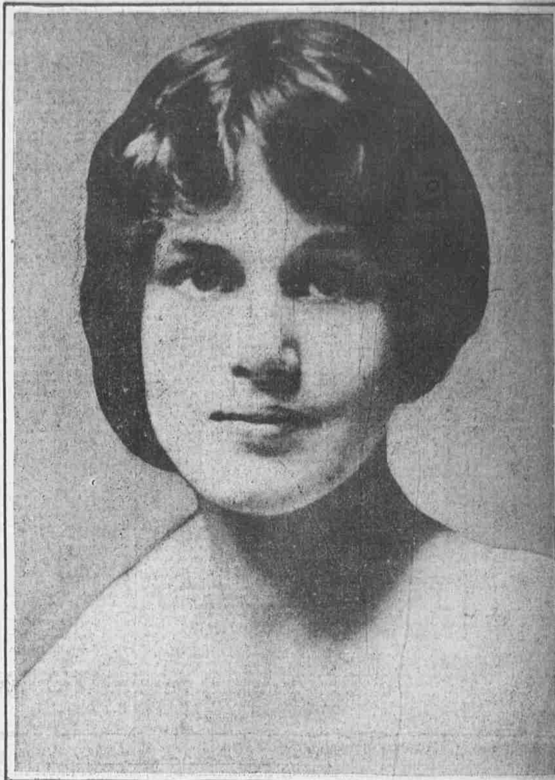
SOUTHERN BELLE ENTERS CAPITAL SOCIETY