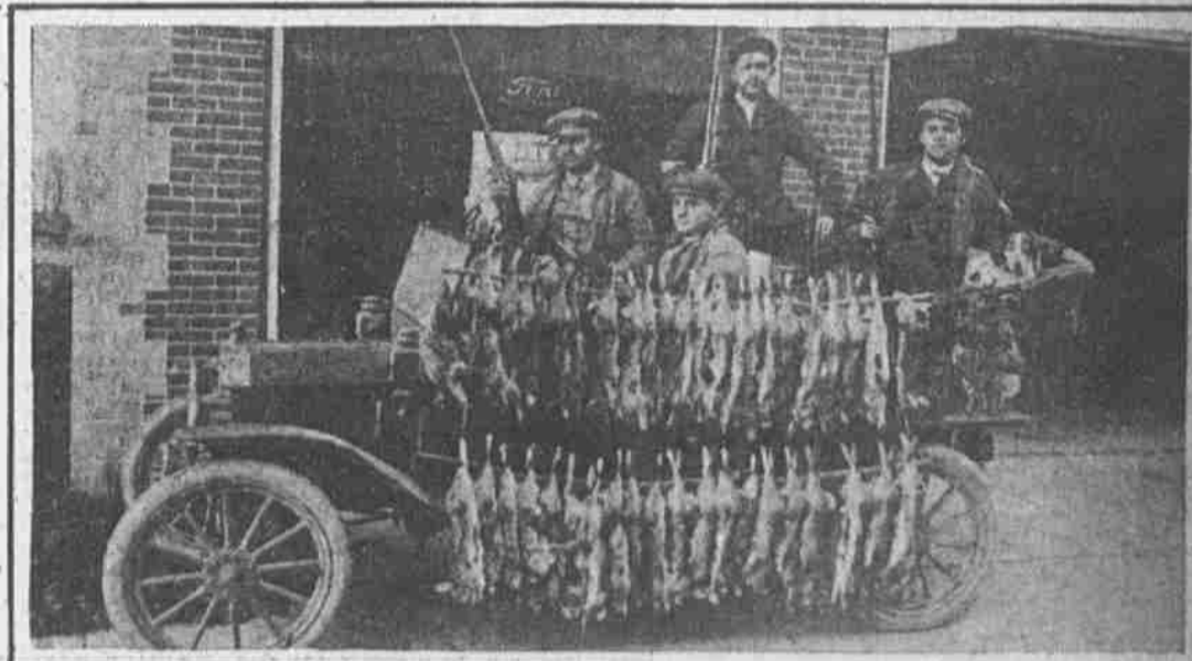
FORTY-TWO RABBITS FELL TO THIS PARTY