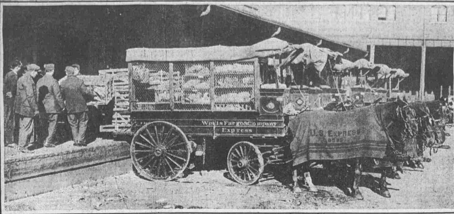
THANKSGIVING TURKEYS ARRIVING BY EXPRESS

SCENES AND EVENTS IN THE NEWS OF THE DAY