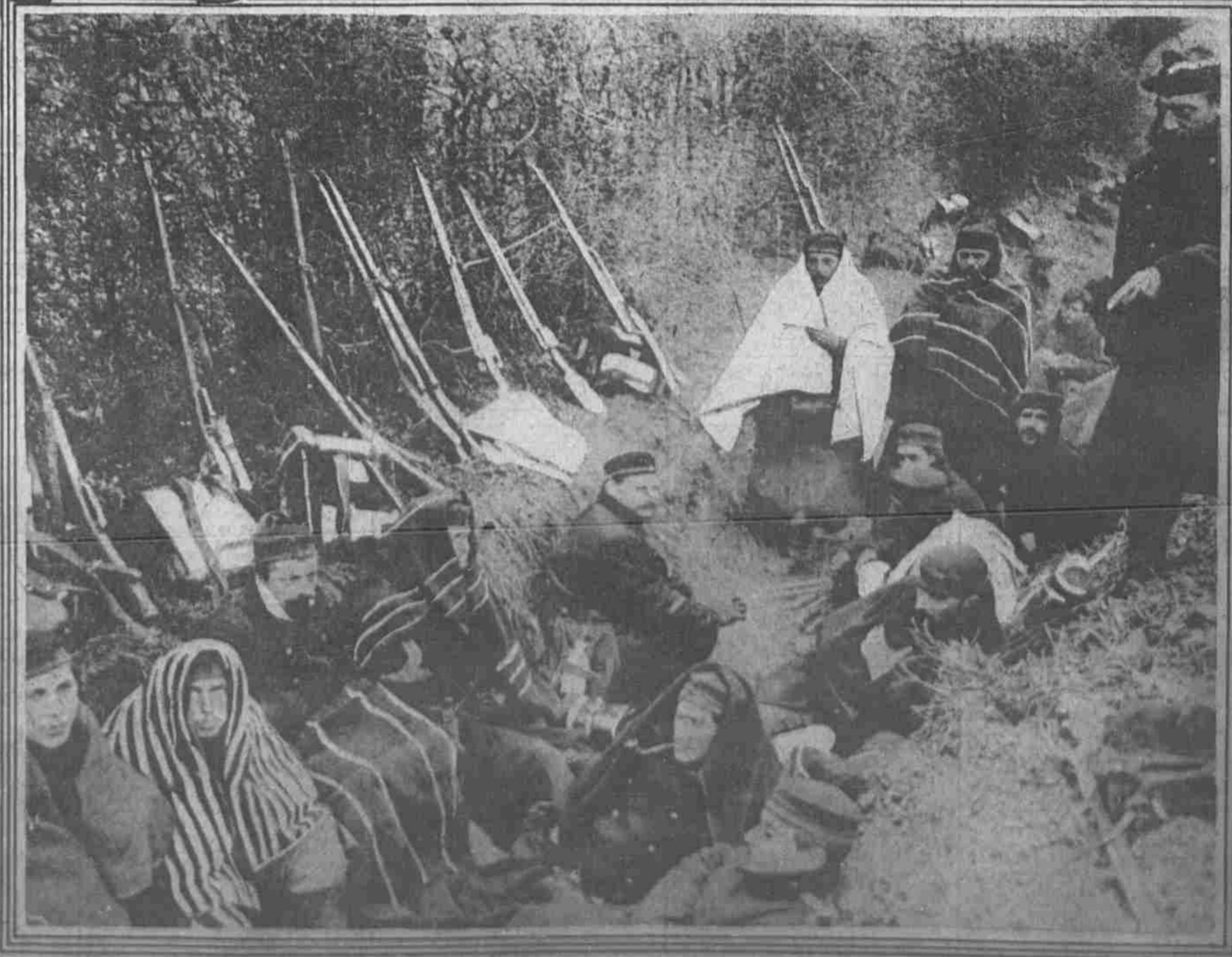
FIRES AND BLANKETS FEEL GOOD IN THE BELGIAN TRENCHES

The foremost warrior is not averse to a little skydiving with the ladies, as is shown by this photograph taken near the Russian frontier in Germany. And there, of course, the line that separates good from bad is very thin for the daughters of Eve enjoy where it well known.