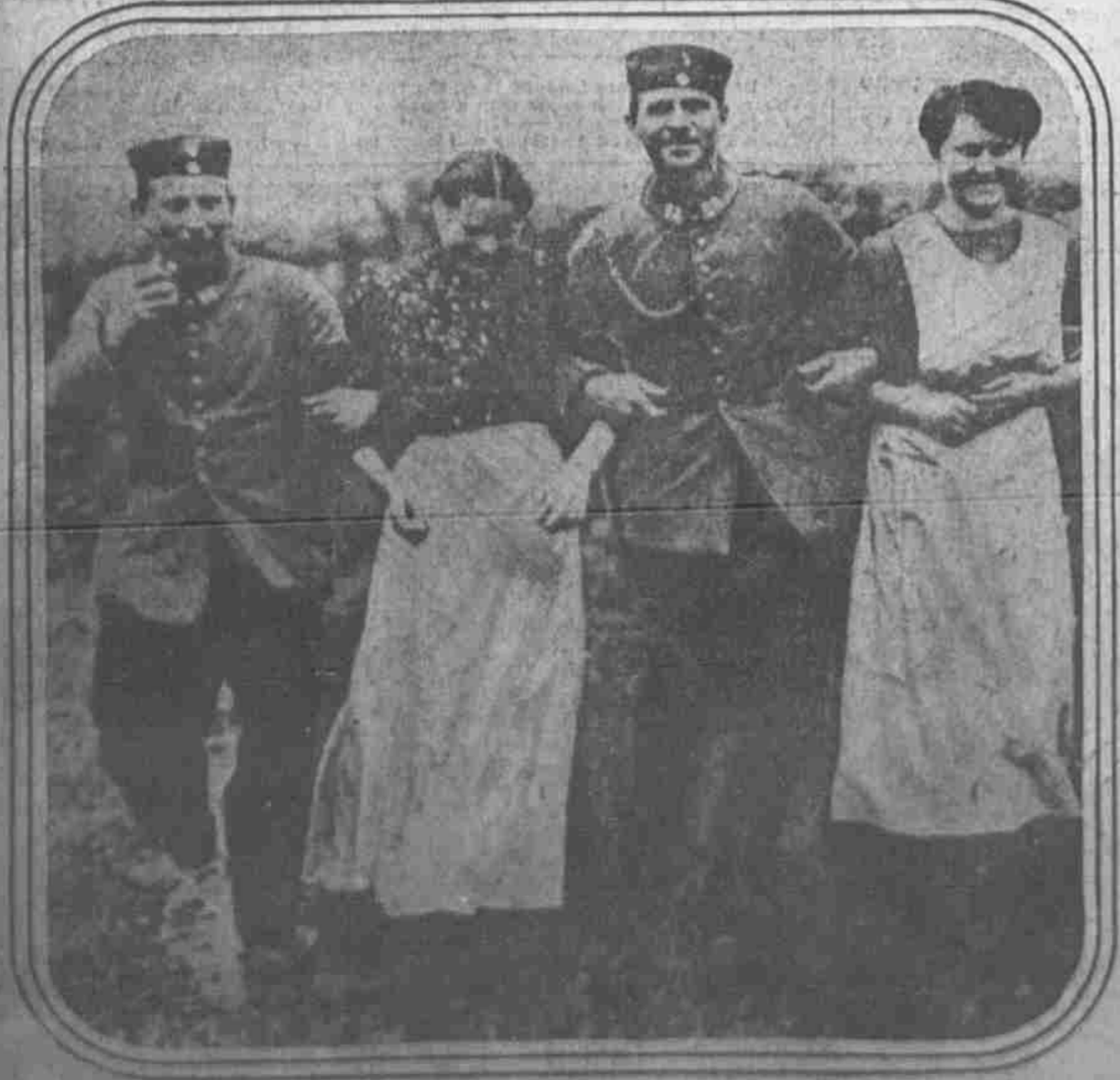
SOME PAUSES BETWEEN RATTLES TO FROLIC WITH VENUS

This lively group is composed of warriors who, though extremely young in years, are full-fledged officers. Some of them will doubtless be compelled to fight Polish relatives fighting on the side of the Czar. Their quaint uniforms are characteristic of the Polish regiments.