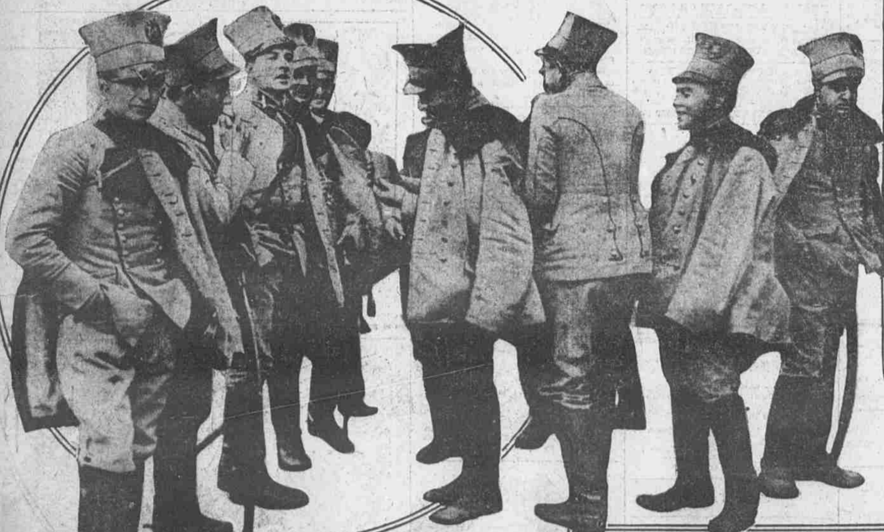
POLISH CAVALRY OFFICERS OF THE GERMAN ARMY

This lively group is composed of warriors who, though extremely young in years, are full-fledged officers. Some of them will doubtless be compelled to fight Polish relatives fighting on the side of the Czar. Their quaint uniforms are characteristic of the Polish regiments.