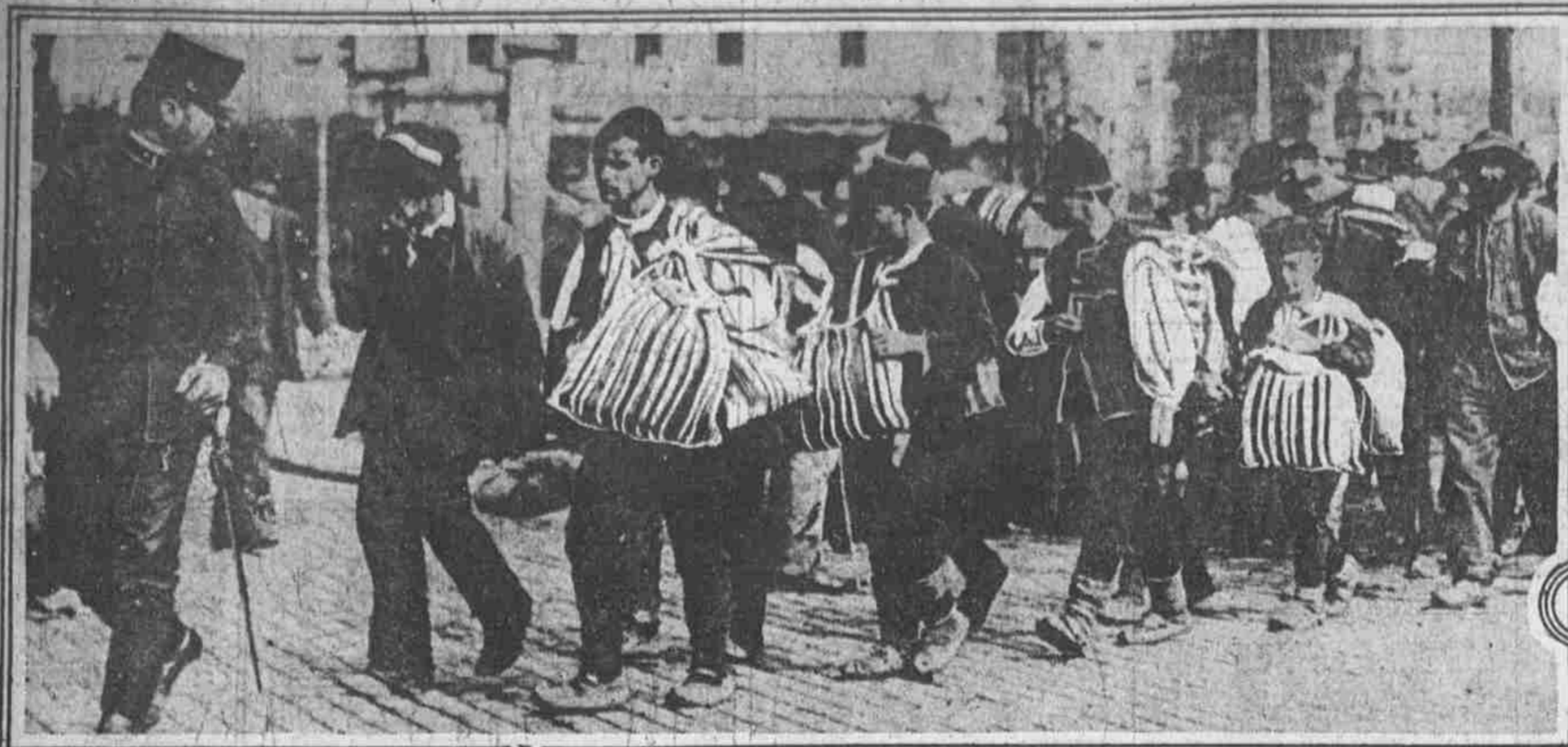
COLUMN OF PRISONERS TAKEN BY AUSTRIANS. These woe-begone individuals are soldiers of Serbia and Montenegro taken prisoner in fighting on the Save River.