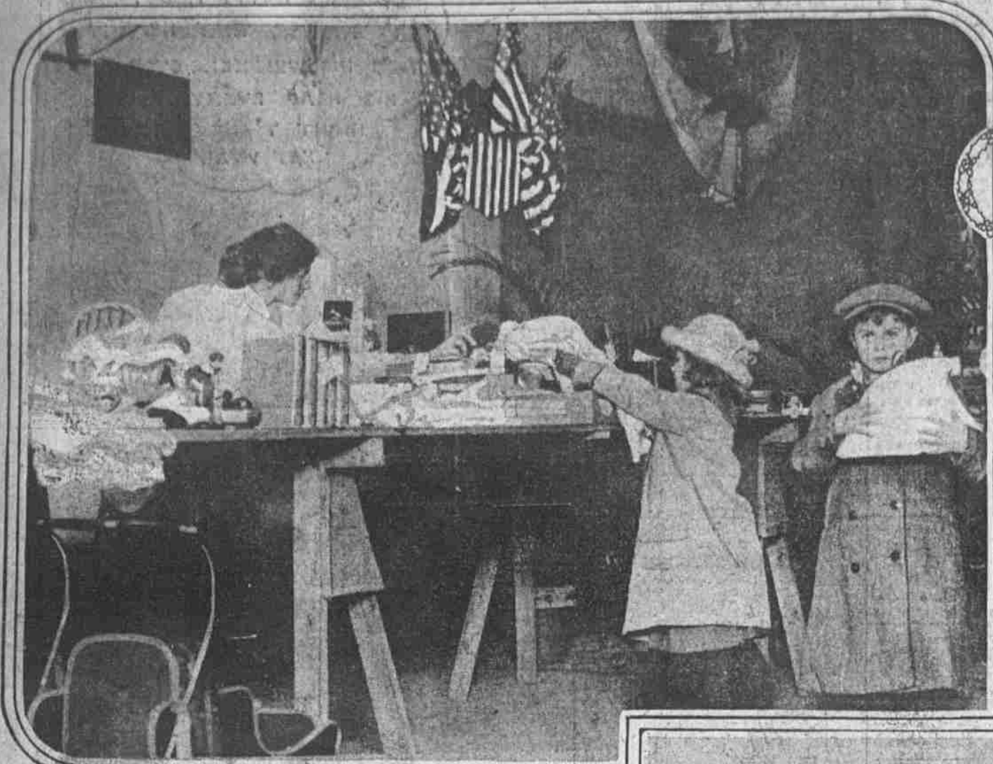
BRINGING IN GIFTS TO GO OUT THROUGH THE CHRISTMAS CLUB. The two children shown in the photograph are typical of the boys and girls who are coming to the Evening Ledger Building, at 608 Chestnut street, every day to leave their presents for the children of the poor. Some bring their favorite toys, others their pennies. The distribution will be made through the churches at Christmas time.