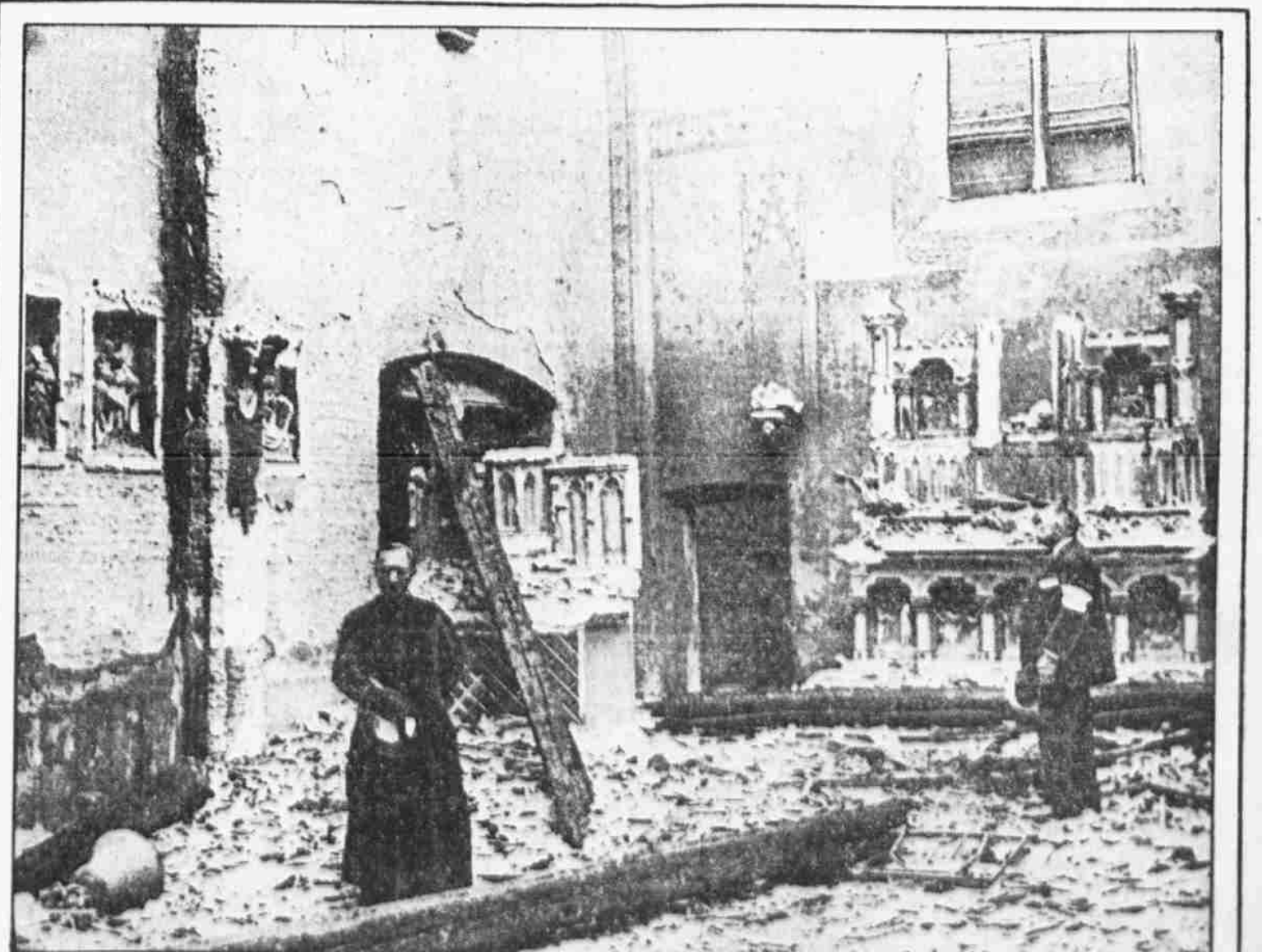
IT DESECRATES HOLY PLACES AND STRIKES DOWN THE ALTARS OF GOD