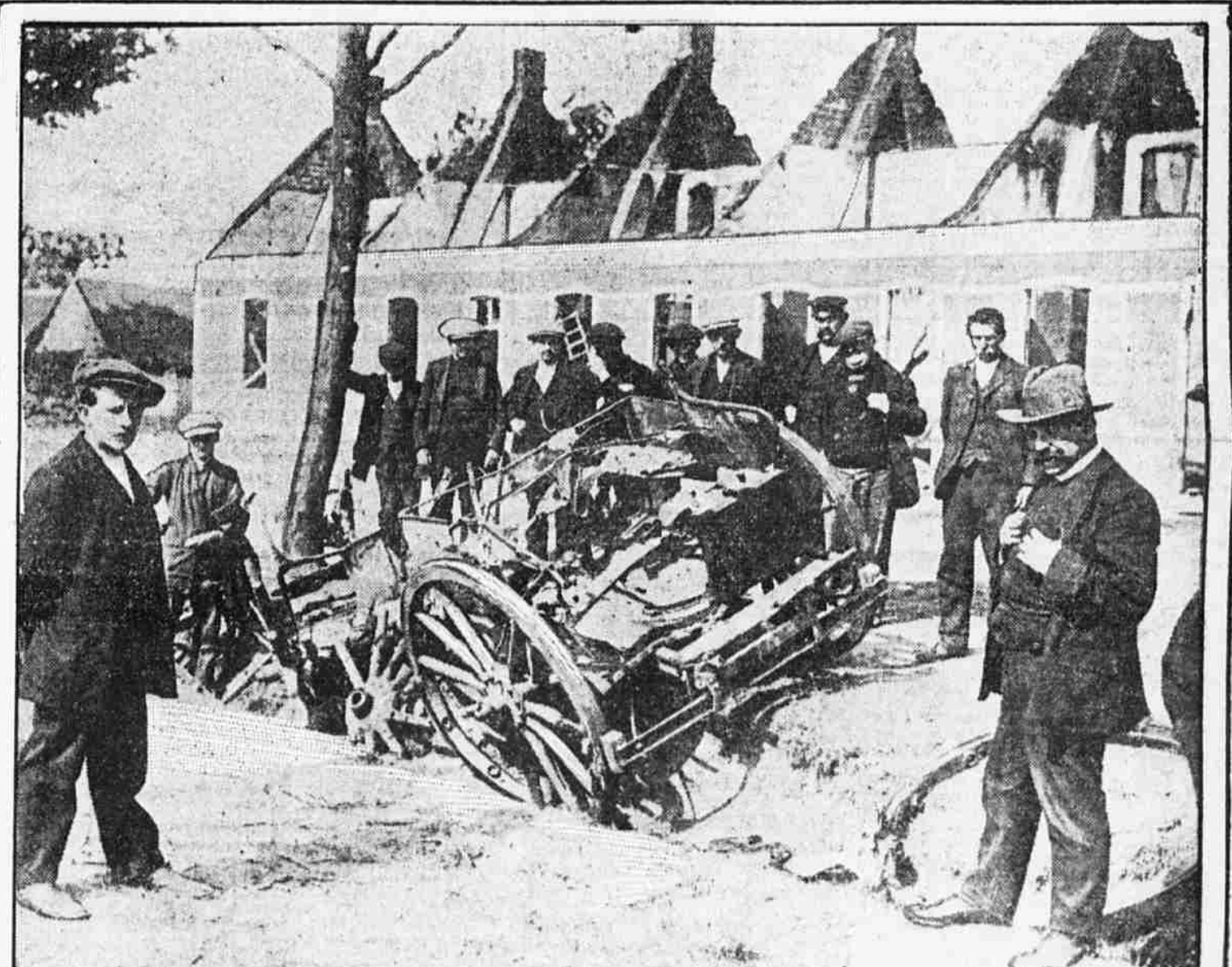
IT BOASTS ITS HAVOC AND LITTERS WAYSIDES WITH ITS DEBRIS