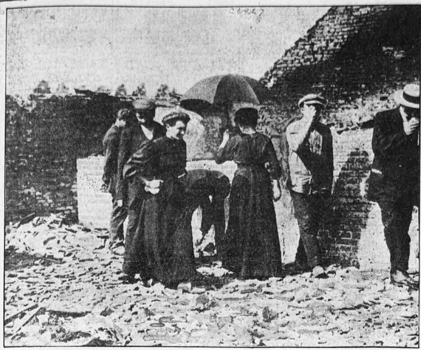
IT SMITES HOME AND WRITES GRIEF UPON THE HEARTS OF THE PEOPLE