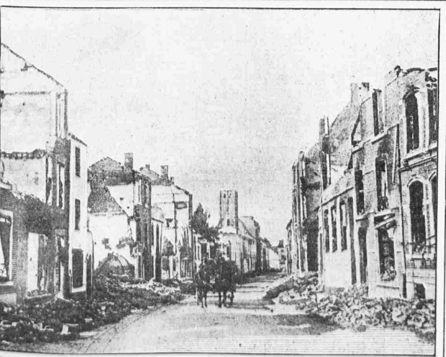
HABITATIONS IT TURNS TO RUIN AND MENS ACHIEVEMENTS IT LAYS WASTE