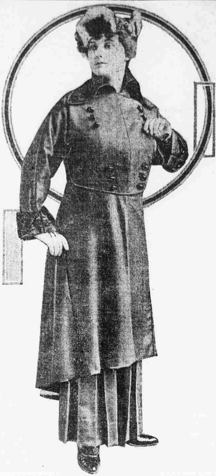
AN INCOMPLETED COSTUME WHICH AWAITS A FINAL FITTING FOR ITS LAST TRIUMPHANT STITCH

Enjoys Her Days Aboard Boat Watching Happy Homeseekers as They While Away the Time.