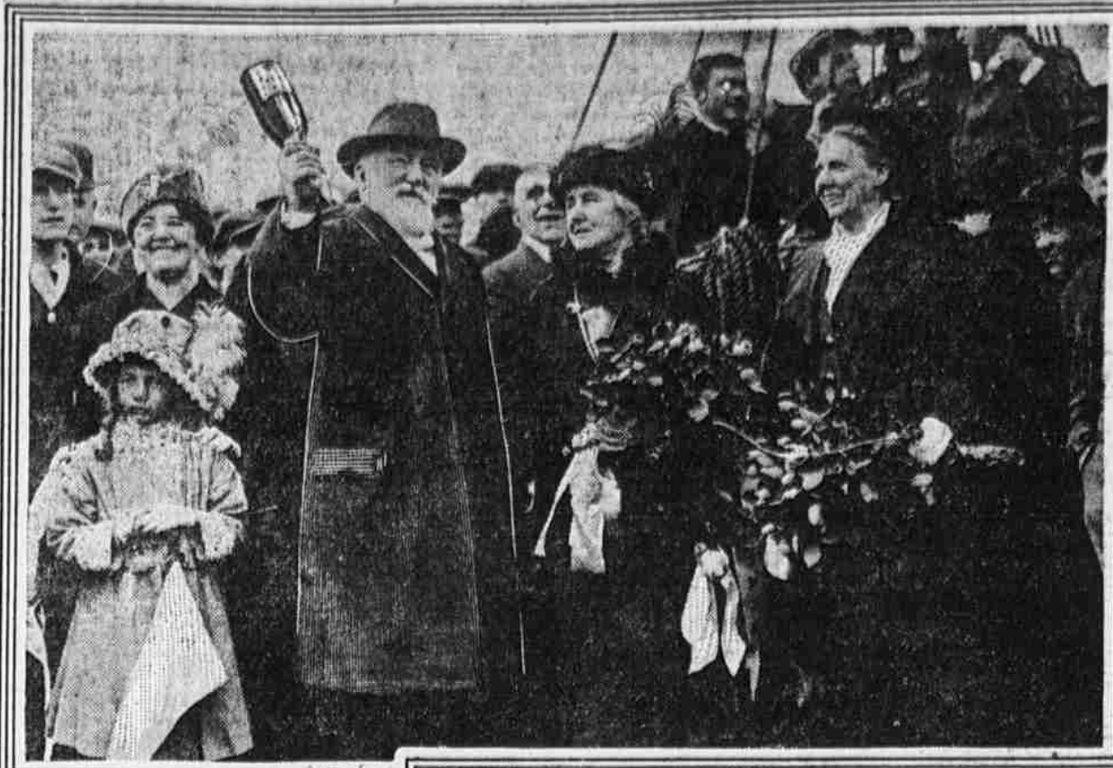
MAYOR BLANKENBURG CHRISTENING THE SUFFRAGE BALLOON