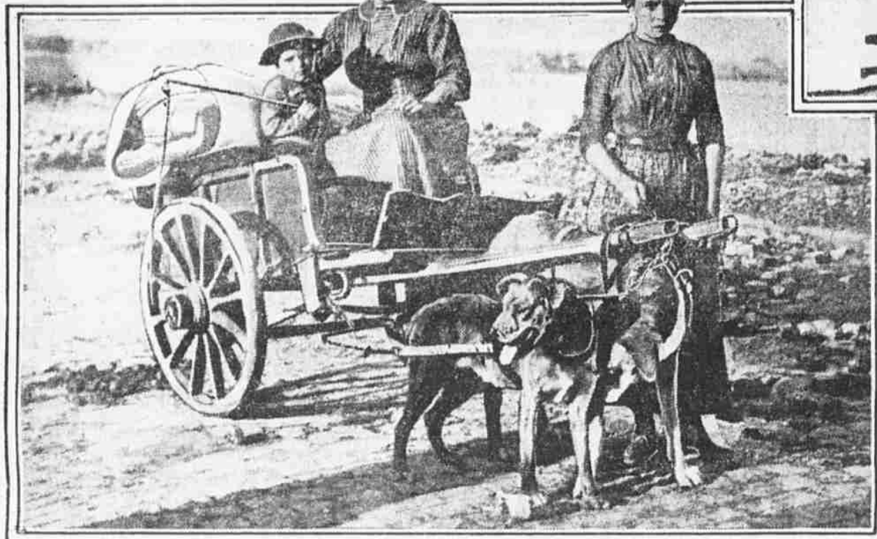
TYPICAL BELGIAN REFUGEES