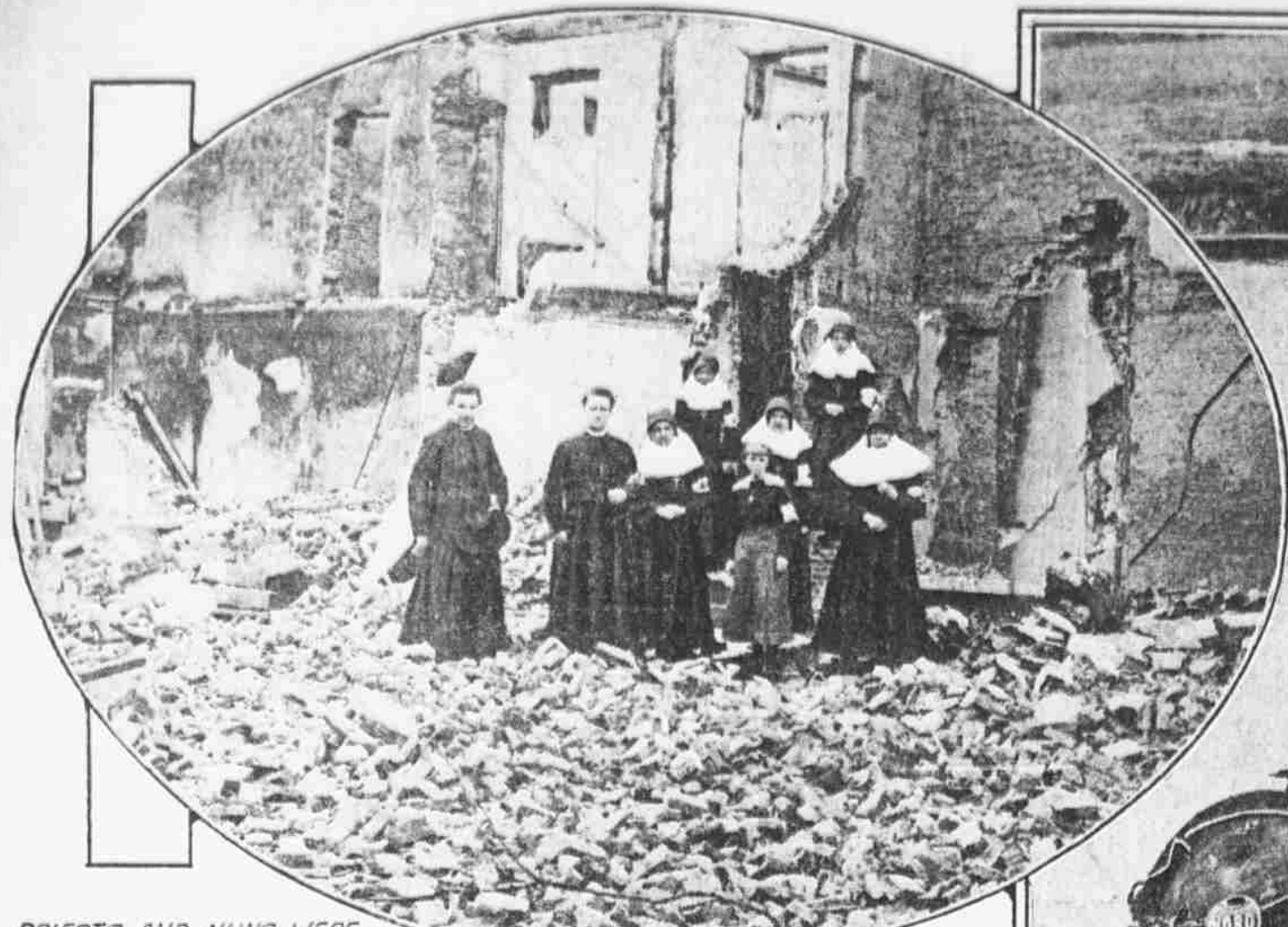
PRIESTS AND NUNS WERE THE ONLY ONES TO REMAIN THROUGH THE CAPTURE AND RECAPTURE OF TERMONDE