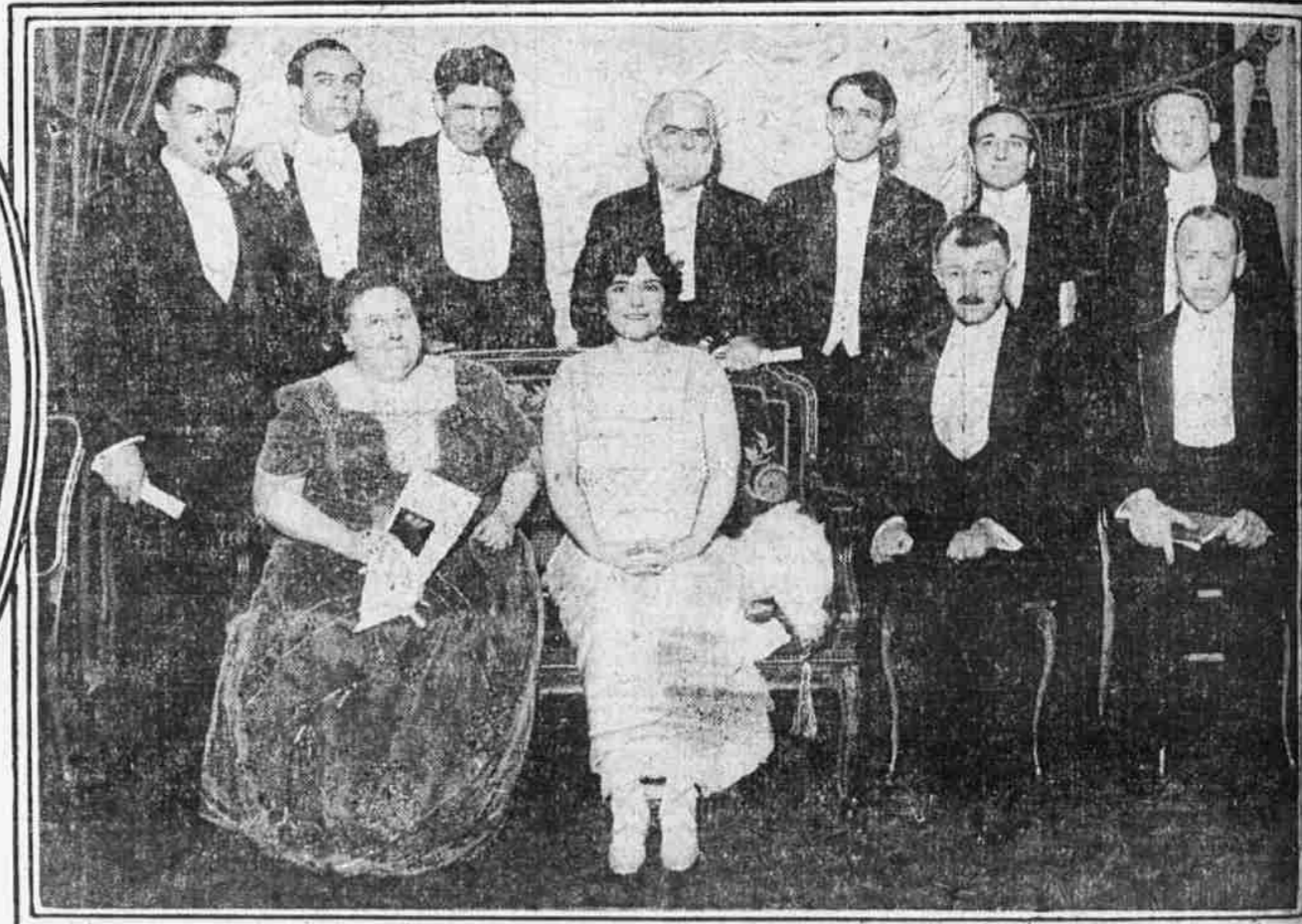
SPRING MAKES US THINK OF POETS, SO HERE IS A LIKELY GROUP This picture was taken at the recent poets' dinner to John Masefield in New York. Left to right, standing, are Lawrence Housman, Witter Bynner, Percy Mackaye, Edwin Markham, Cale Young Rice, Louis Untermeyer and Yachel Lindsay. Sitting—Amy Lowell, Josephine Daskam Bacon, John Masefield and Alfred Noyes.