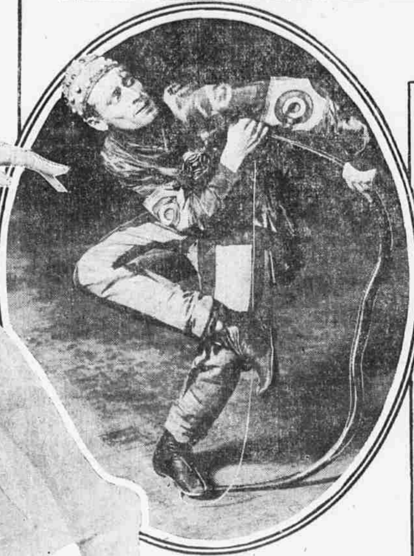
ADOLPH BOLM AS PRINCE IGOR This devotee of interpretative dancing has the leading role in Fokine's setting of the dances from Borodin's opera, "Prince Igor."