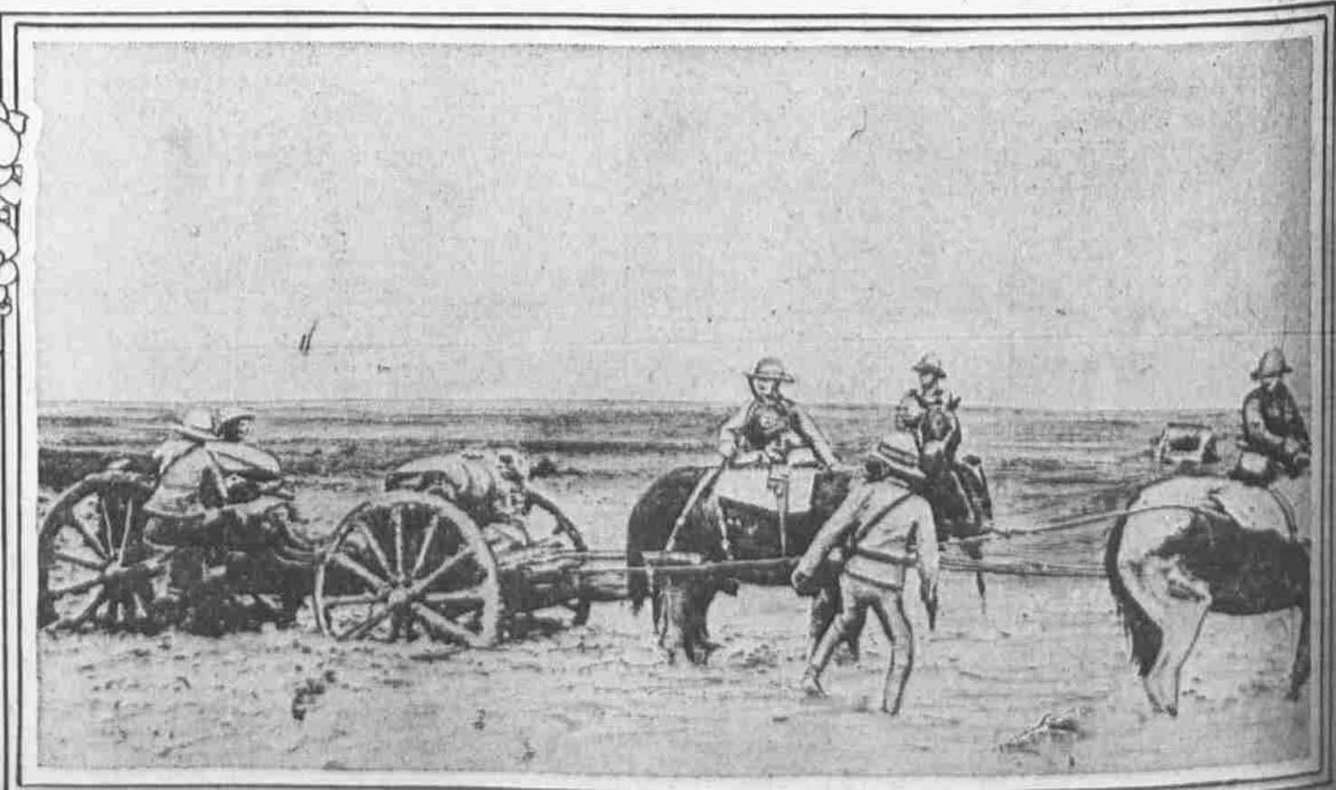
WHAT THE BRITISH ARE UP AGAINST IN THEIR MESOPOTAMIAN CAMPAIGN The picture shows a British gun stuck in the desert quagmire at Basrah, following a heavy rain, and reveals the difficulties that must be overcome in going from the Persian Gulf to the reinforcement of the force beleaguered by the Turks at Kut-el-Amara.