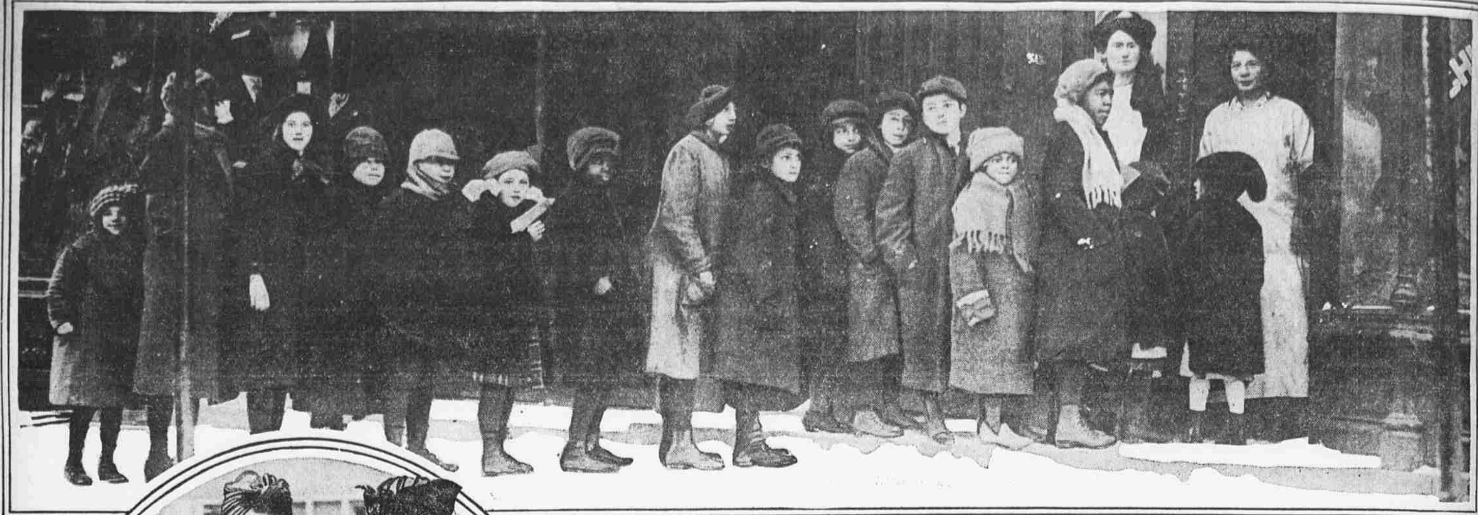
CHILDREN LINING UP FOR FREE BREAKFAST EVERY MORNING BEFORE THEY GO TO SCHOOL The Volunteers of America discovered that the boys and girls of many wage-earners' families were going to their daily studies so hungry that they were unable to keep awake, despite the fact that prosperity is supposed to be on amicable terms with the whole United States. This led to the establishment of these free breakfasts at 259 North 9th street.

SIDELIGHTS ON THE NEWS OF THE DAY AS GATHERED BY THE EVER-PRESENT CAMERA MAN