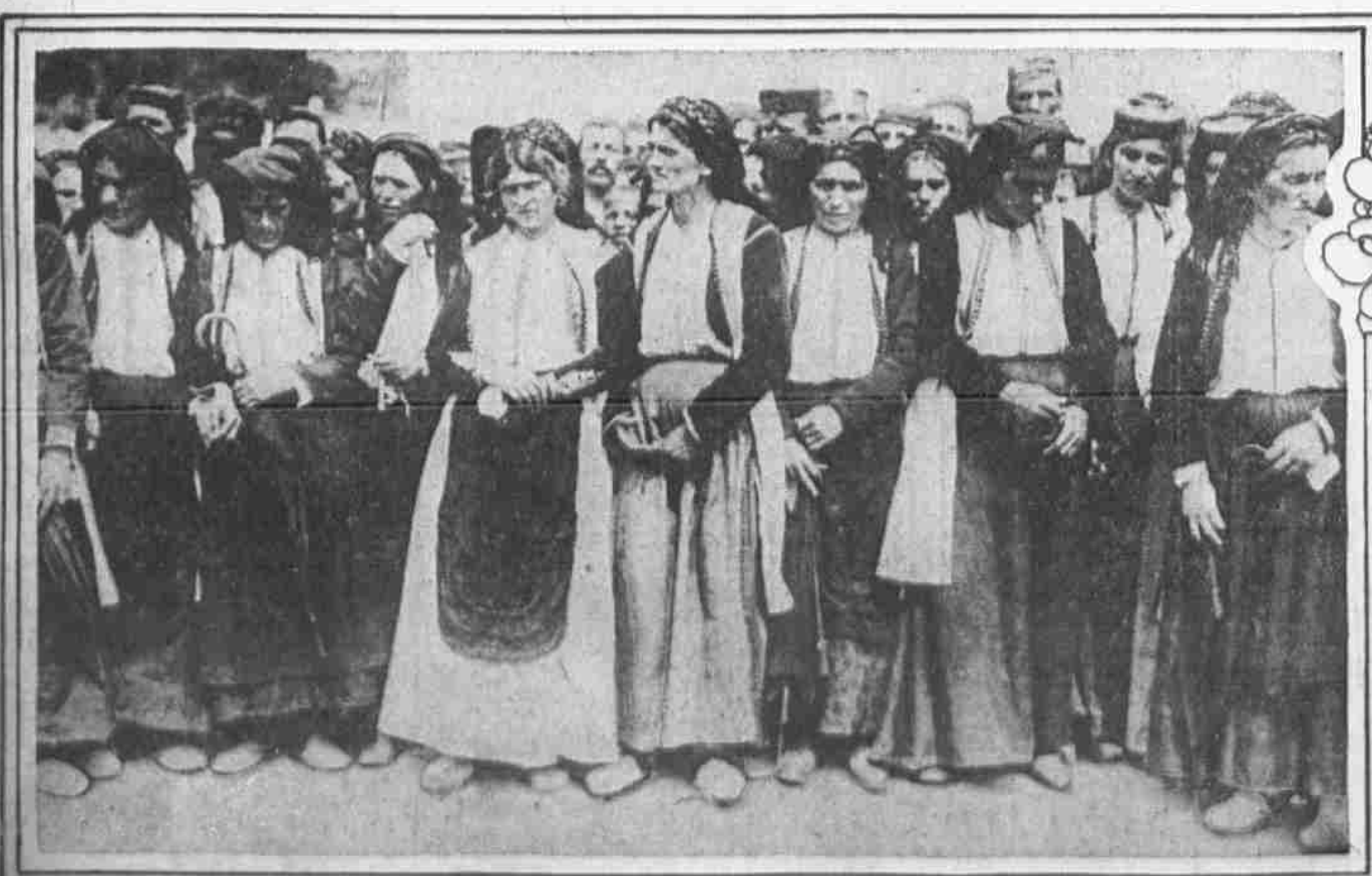
WOMEN OF MONTENEGRO FLEE THEIR COUNTRY IN THEIR BEST SUNDAY CLOTHES When the Teutons overran the little kingdom the women of the well-to-do class left for Italy and France. A group of them in their picturesque native costumes are shown waiting to board a ship.