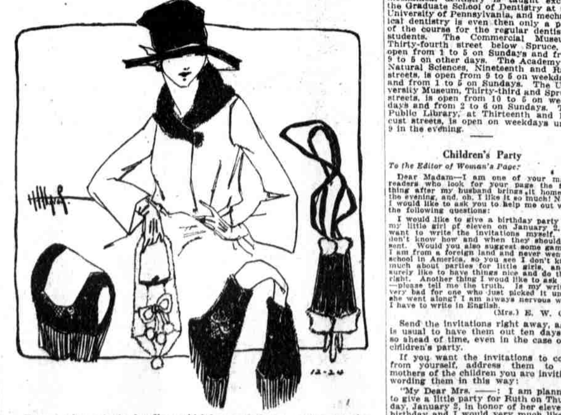
Here are shown the fur handbags which have won their way into woman's heart. They are described in today's fashion article.

TAKING every part of women's apparel into consideration, there is no article in the category of either garments or accessories that shows such lightning changes as do purses and handbags.