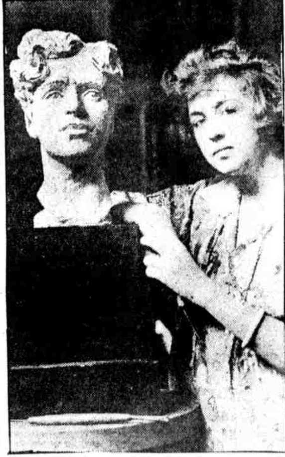
AT THE LEFT—WHO IS IT? Charlie Chaplin had to remain quiet a few hours while Mrs. Clare Sheridan, English sculptress, worked