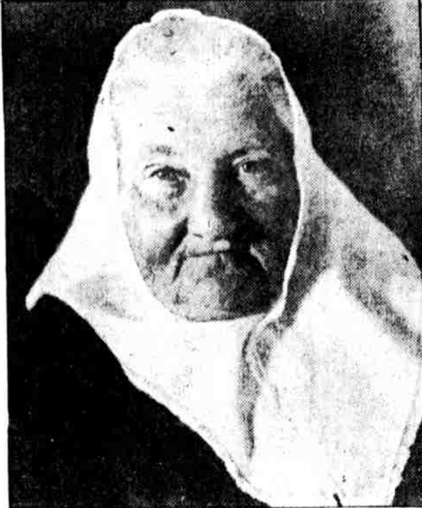
MME. CATHERINE BRESHKOVSKY, known as the "Grandmother of the Russian Revolution." She is now living at Prague