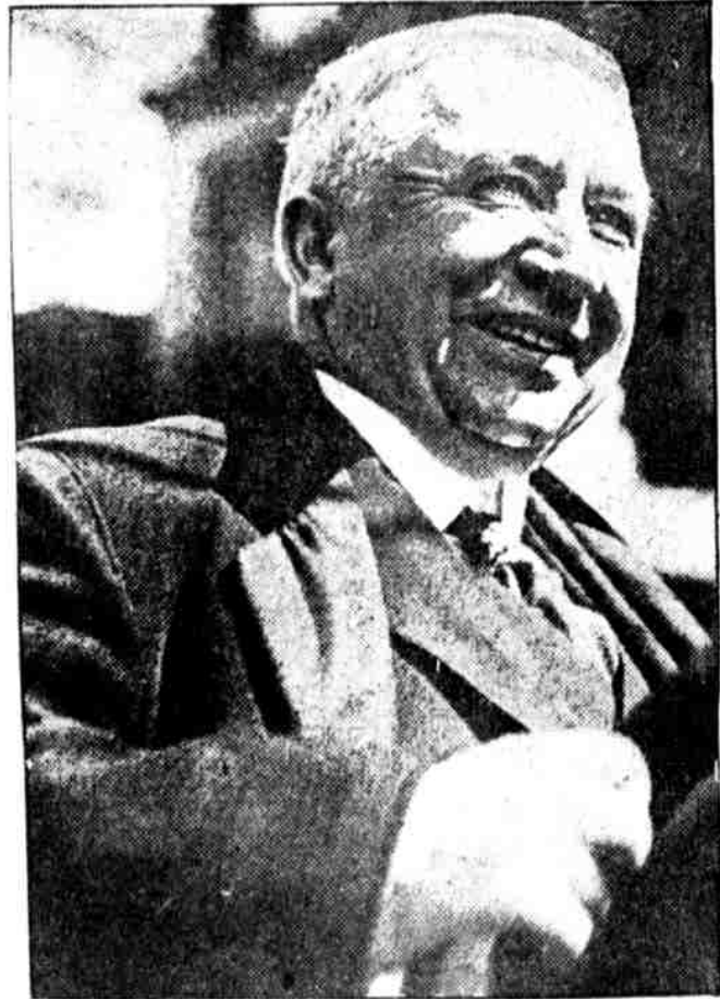
TO FACE SHIPBUILDING INVESTIGATION. Charles W. Morse agrees to sail from Havre to New York on Monday if not arrested. He's under guard