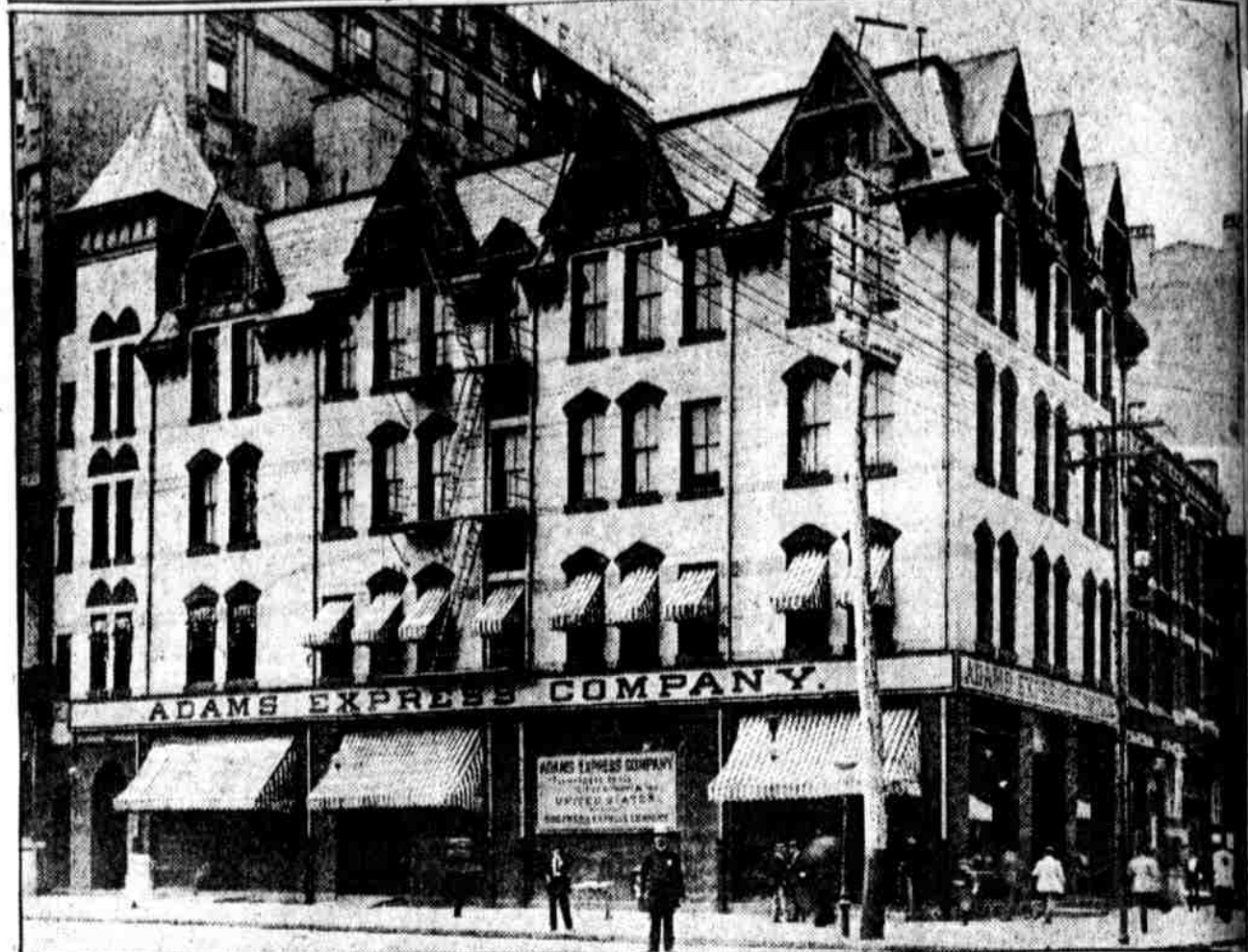
WHERE LAND TITLE BUILDING STANDS TODAY. Etching shows office building that stood on the southwest corner of Broad and Chestnut streets. It was torn down in 1897 to make way for the present structure. At the left is a glimpse of old Lafayette Hotel. Have you an old Philadelphia photograph? Send it to the EVENING PUBLIC LEDGER.