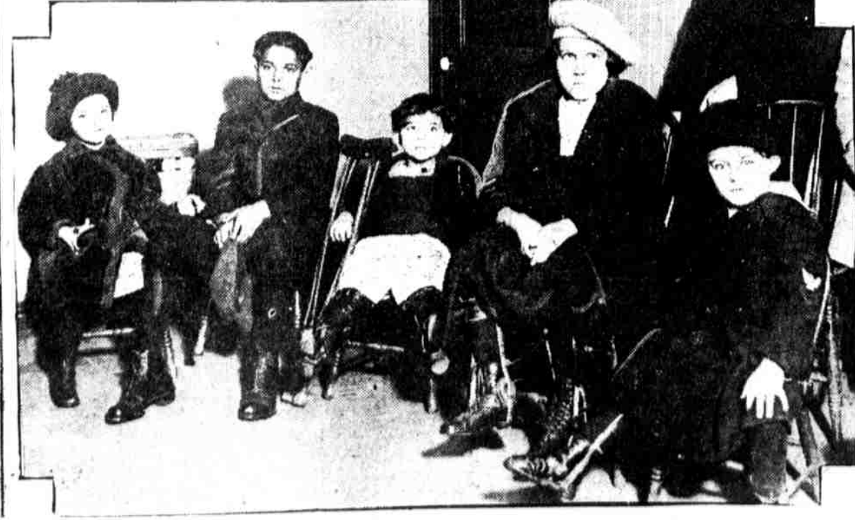
GETTING READY FOR DR. LORENZ. At the Samaritan Hospital yesterday were many Philadelphia children who want the famous Austrian surgeon to help them. They braved the rain to make their applications. Dr. Lorenz will visit Philadelphia soon