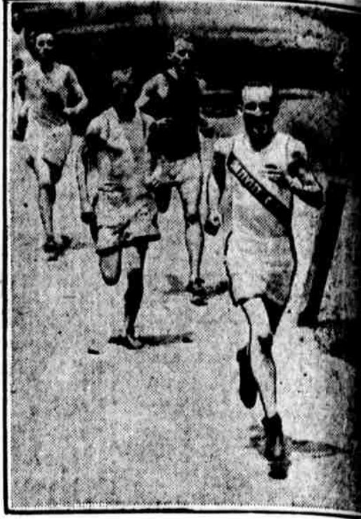
GOING THROUGH BRYN MAWR