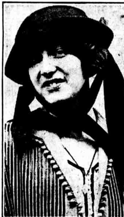
SHE'LL BE GONE SEVEN WEEKS. Elsie Ferguson on the Mauretania as she leaves for business trip