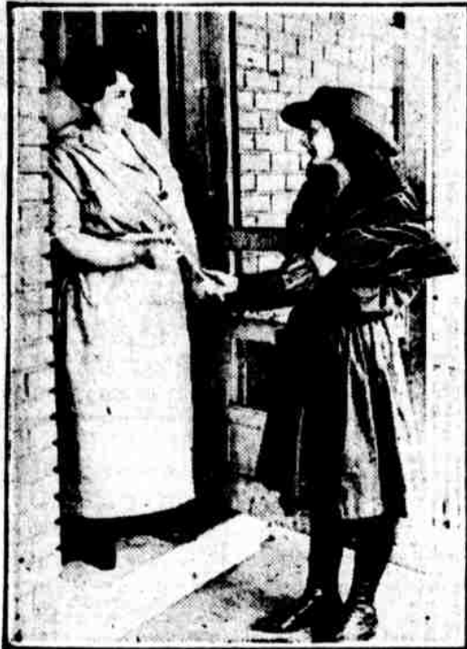
GIRL SCOUTS DECLARE WAR ON FLIES. They are now distributing 100,000 fly swatters in New York city