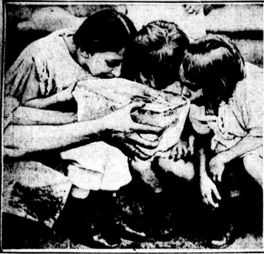
THEY ENJOYED THE ICE. An accommodating iceman on Catharine street made a hit with these youngsters.