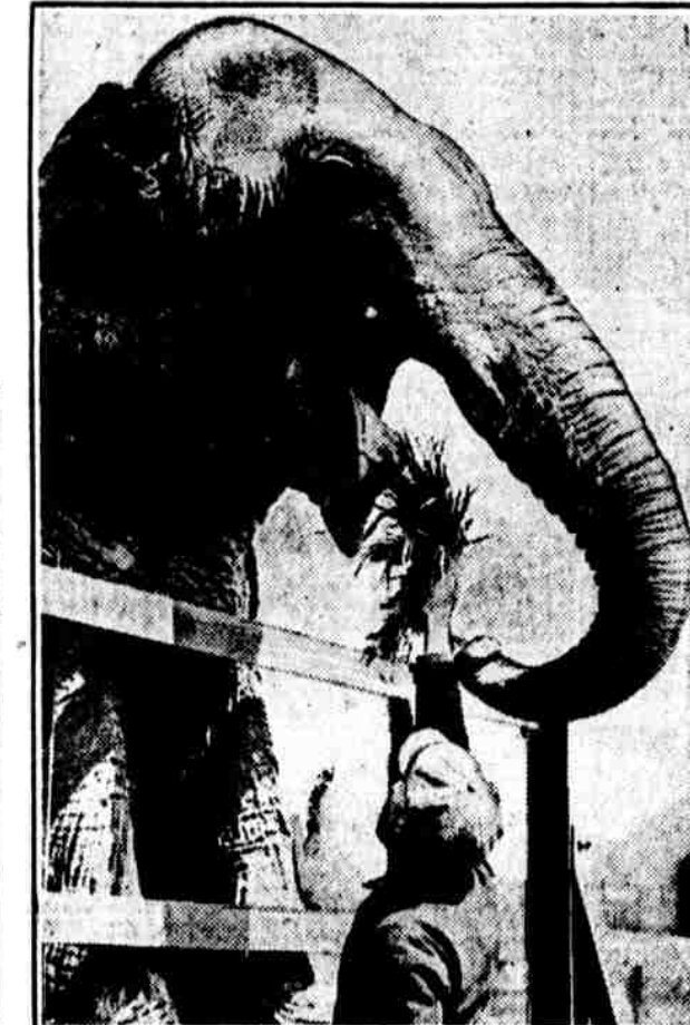
TONY LIKES HAY. The pet elephant at the Franklin Zoo, in Boston, is willing to do tricks for a bit of choice food