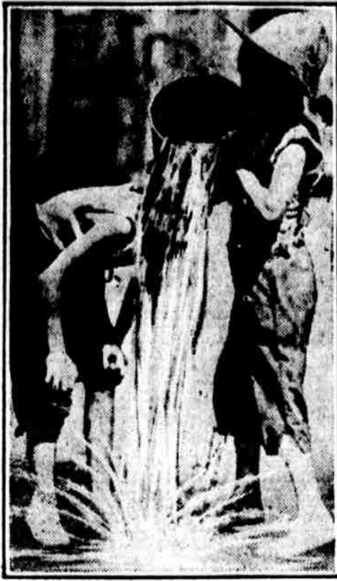
A PAL WHO IS A PAL. When the thermometer is at the 90 mark a bucket of water doesn't seem enough