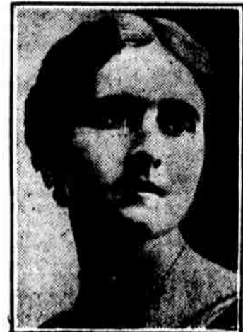
PRINCESS ELIZABETH, wife of Crown Prince George, of Greece, in her latest pose