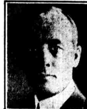
CHARLES V. VICKERY, general secretary of the Near East Relief, leaves for Europe