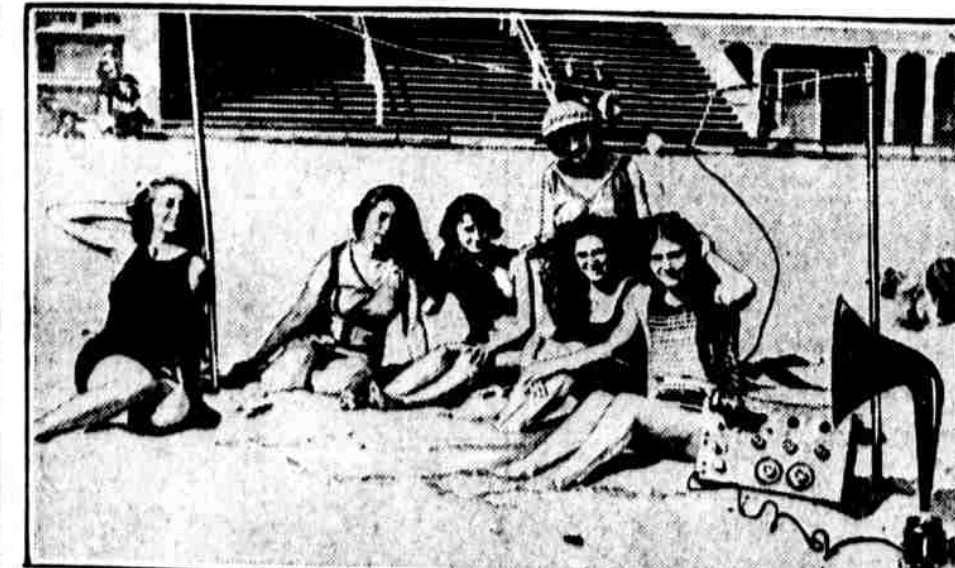
HOW WE ENVY THE FAIR BATHERS. Neptune Beach, California, would have suited many Philadelphians yesterday. The girls were drying their hair as they enjoyed aerial waves