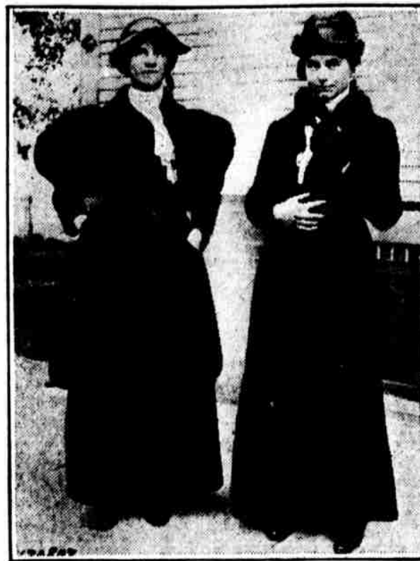
SHOWING YOU THE "FLAPPER OF 1870." In a Milwaukee fashion show these dresses were worn by way of contrast with the 1922 girl