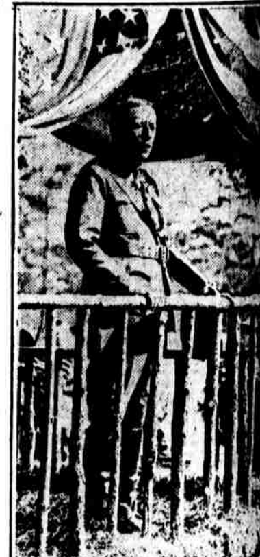
MAJOR GENERAL JOHN BIDDLE makes Memorial Day address at Brookwood Cemetery near London. 450 Americans are buried there