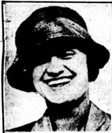
ALMA GLUCK is back from Europe after visiting parents of husband, Efram Zimbalist