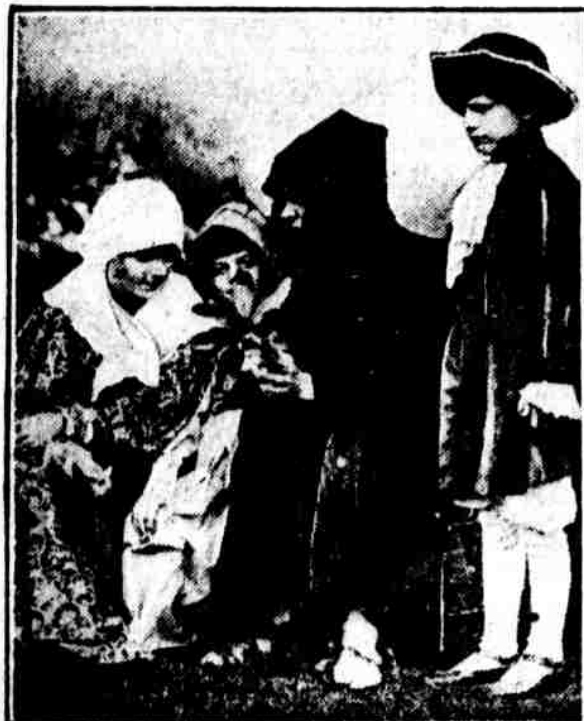
EVENTS IN GERMANTOWN DURING THE COLONIAL PERIOD were shown in the pageant presented on the lawn of the Manheim Cricket Club, on Saturday