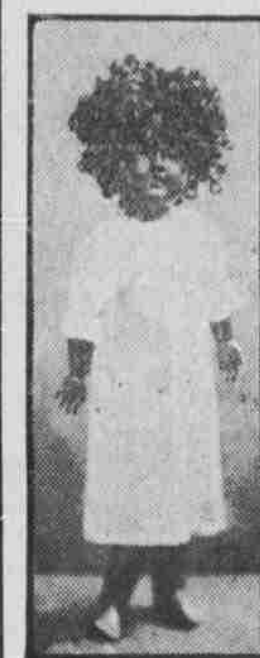
Doll as it looks when purchased

If any person desires to see an illustrated catalogue with complete prices, send us 5c, and we will send this booklet