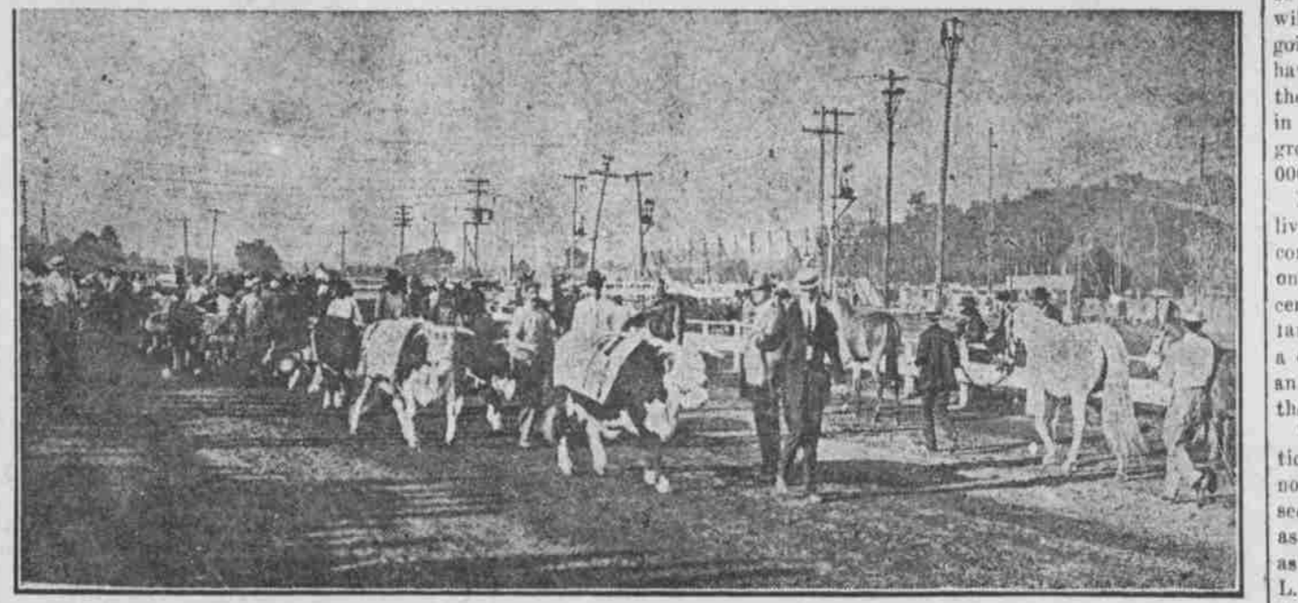
THE GREATEST LIVE STOCK SHOW IN THE SOUTH AT TENNESSEE STATE FAIR. PARADE ONE MILE LONG.

Best Announcement Yet About the Tennessee State Fair. The best announcement that can be made in connection with the Tennessee State Fair and the one that is looked forward to with the most interest is the announcement of the low rates offered by the railroads and the territory these rates cover.