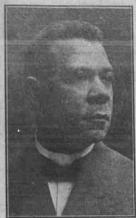
Dr. Booker T. Washington PRINCIPAL TUSKEGEE NORMAL AND INDUSTRIAL INSTITUTE.