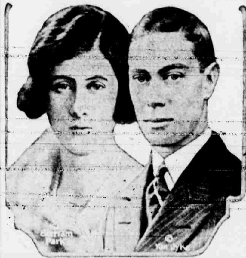
Announcement of another royal engagement is expected soon. It is reported that Albert, duke of York, brother of the prince of Wales, is to marry Lady Rachel Cayndish, daughter of the duke of Devonshire.