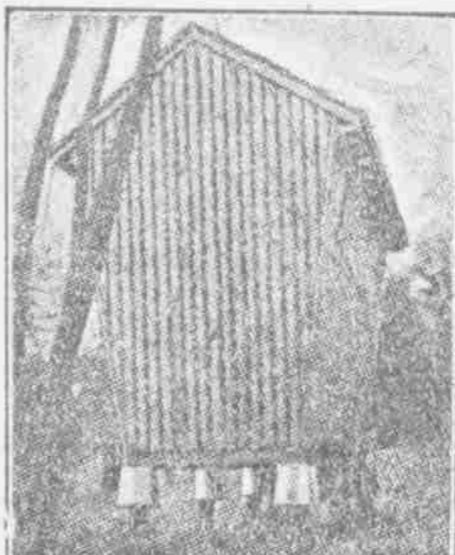
ODD WAY OF PROTECTING A CORN CRIB.

Every possible device is resorted to at this season of the year—when the old corn is becoming scarce and the