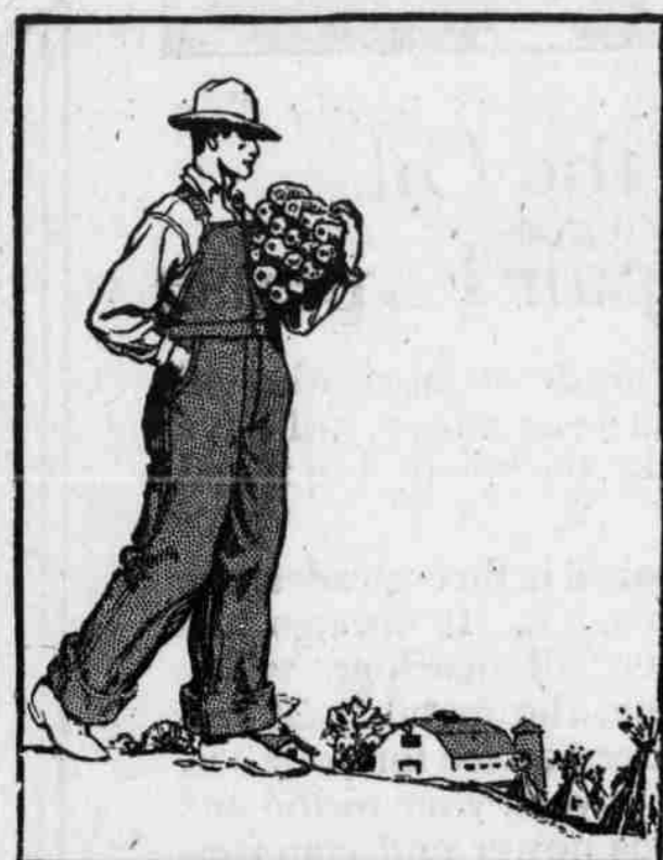
"Plowing—reaping—no matter what the farm work—Blue Buckles are the overalls to wear."