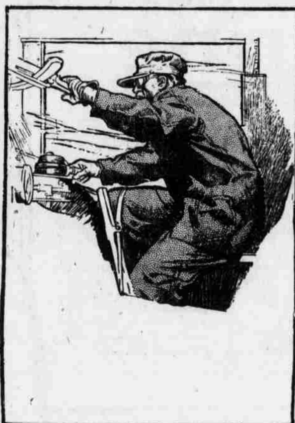
"Tough as rawhide, big, roomy and comfortable—that's what I know about Blue Buckles."