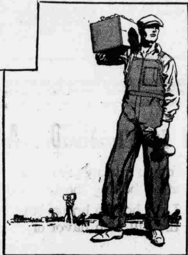
"Every pair of Blue Buckles is always big, strong and comfortable."

Engineer of the Twentieth Century Limited.