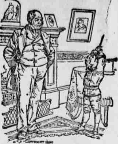
USED THEM IN HIS BLOW-GUN.