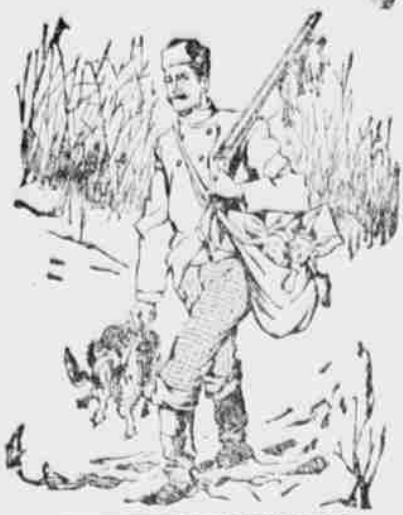
RETURNING FROM THE HUNT.