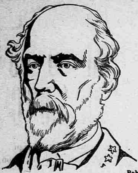
Robert E. Lee