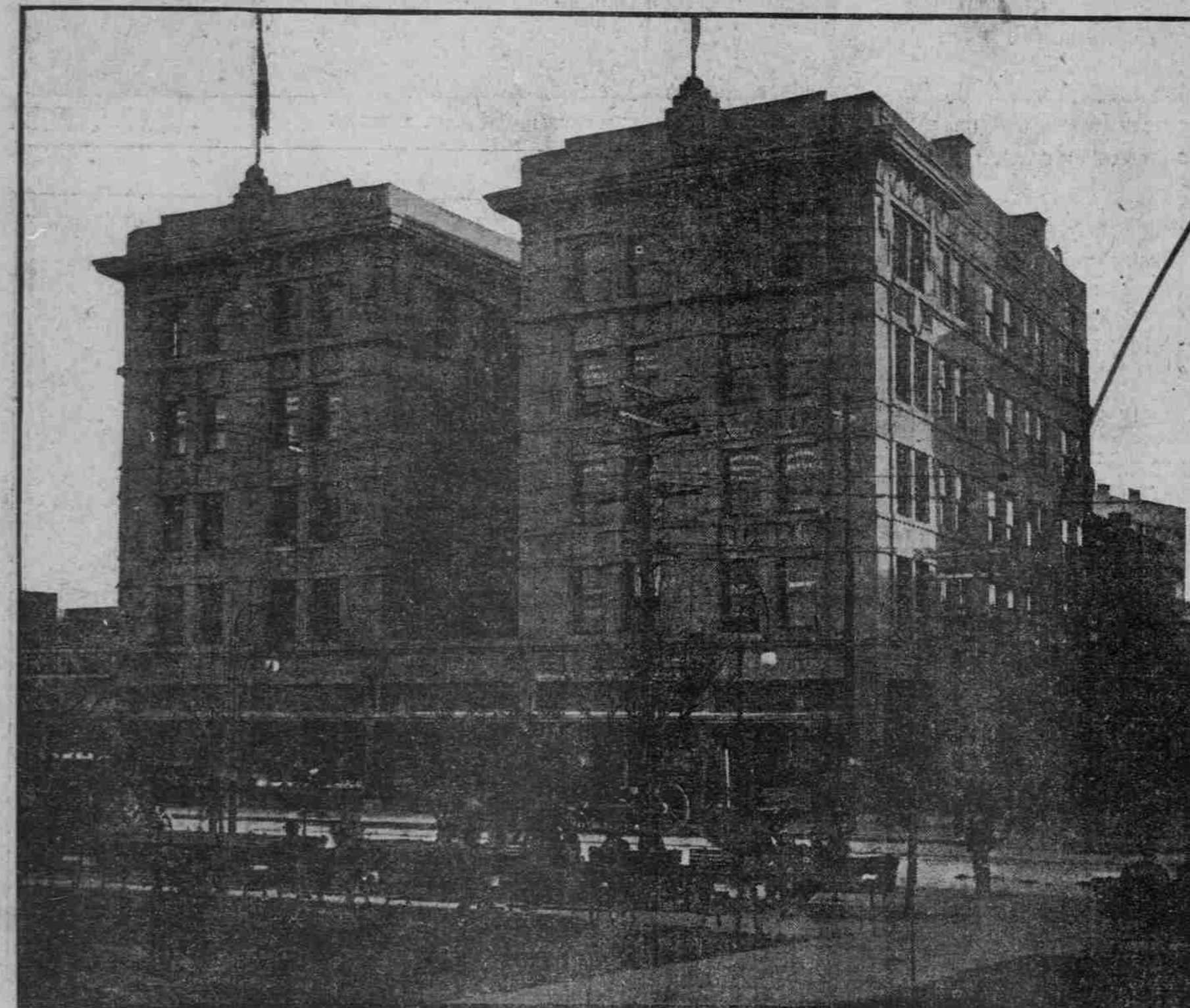
Sorenson & Morgan, Contractors.