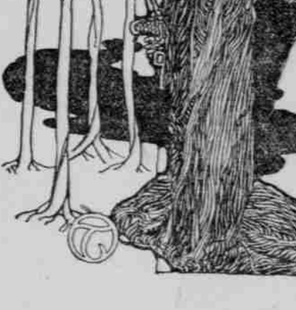
September 6, 1901, president McKinley was shot at Buffalo while holding a reception. Find the President. ANSWER TO YESTERDAY'S PUZZLE. Upside down, head under first's chin.

Lost and Found. LOST-Near postoffice, gold neck chain and locket with monogram on locket, M. E. B. Please return to 916 N. Kansas St. and receive liberal reward.