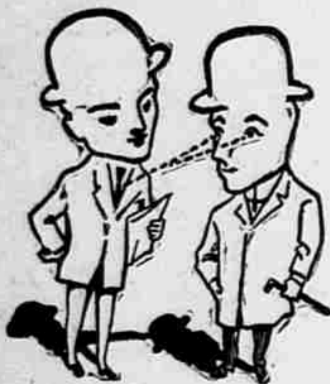
"THE DIAMOND ATTRACTIVE."

And what beats it for an investment? Always saleable, or exchangeable; no depreciation in value. Then why be without them? Our stock is complete, having all sizes and prices to suit.