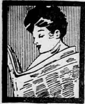
WE ARE SHOWING

Some new Sterling Wares of the Gorham, Reed & Barton make, in Bowls, Bon Bons, Sandwich and Bread Trays, Creams and Sugars, Coffee and Tea Sets. In the flatware we carry many of the patterns, in any and all prices. This line of Silverware, along with our stock of Jewelry, Cut Glass, China and Bric-a-Brac, enables one to select what is wanted with little difficulty. Call and see us.