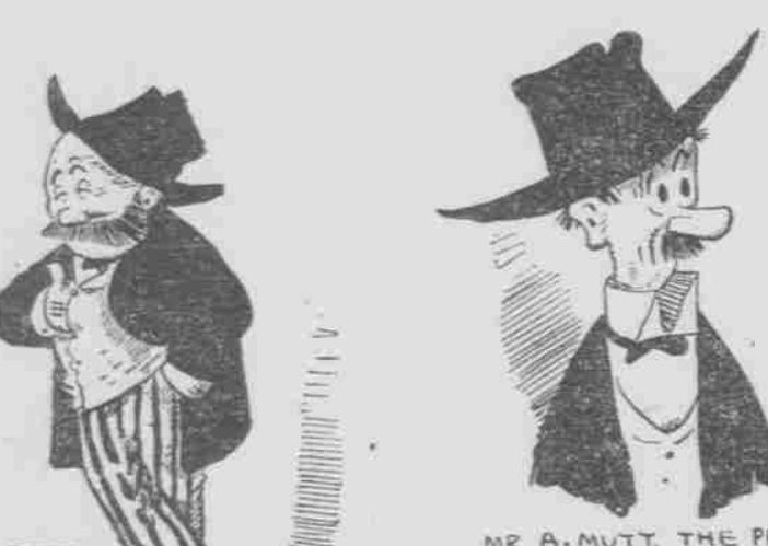
MR. A. MUTT, THE PROMINENT POLITICIAN WHO CLAIMS THAT HE IS ENTITLED TO A CONVENTION OF HIS OWN...