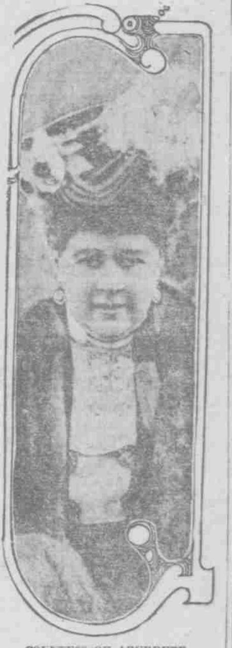
COUNTESS OF ABERDEEN.