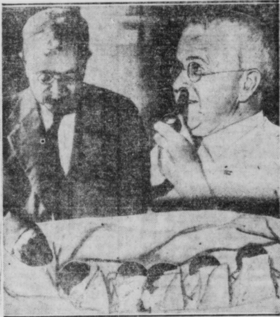
Knighthood and the Nobel Prize in medicine are proposed for Dr. Awlas Ray Dafeo, backwoods practitioner who saved the Dionne quintuplets. Dr. Dafeo is to visit eastern U. S. cities to tell doctors of his experiences with the famous babies born in the Canadian wilds.