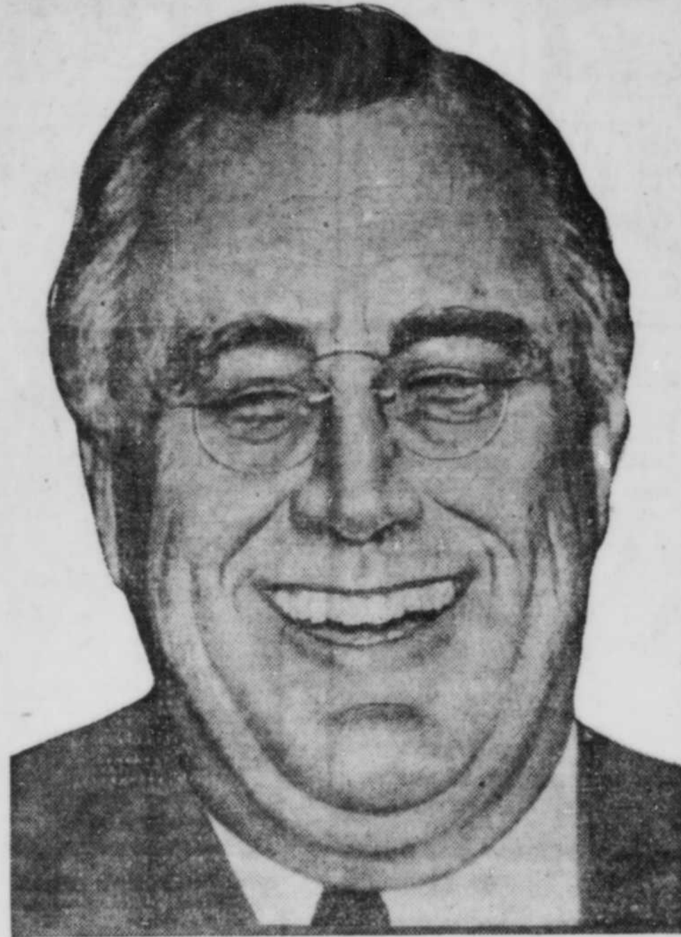
Newest closeup of Franklin D. Roosevelt, taken at Warm Springs, Ga., speaks for itself.