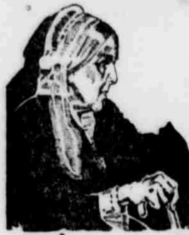
How glorious you will feel, mother, when your rheumatism is all gone. Let S. S. S. do it. It will build you up, too!

S. S. S. Thoroughly Rids the Body of Rheumatism Impurities.