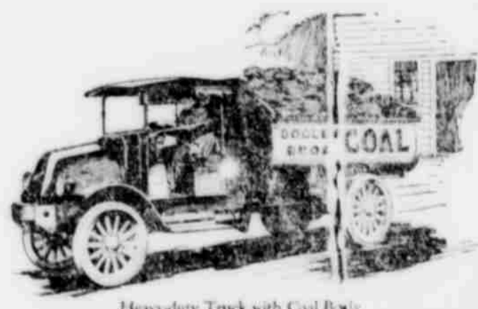
Heavy-duty Truck with Coal Body