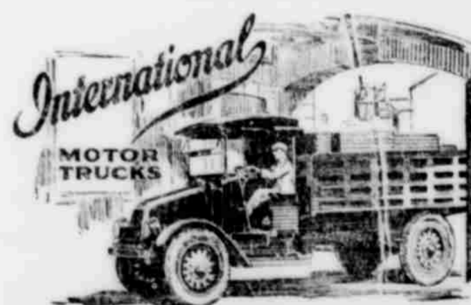
With Special Transfer Body

Back of this Service Policy stands a Company with more than 90 years of successful manufacturing experience—a Company operating two large motor truck factories, with a third under construction—a Company employing thousands of motor trucks in its own organization—a Company that knows what actual hauling economy means in its own business, and one that builds motor trucks for just one purpose, "Low-Cost Hauling."