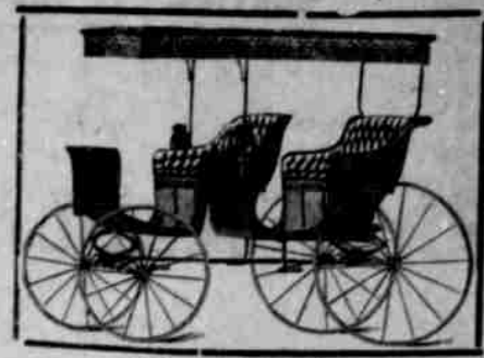
With or Without Top