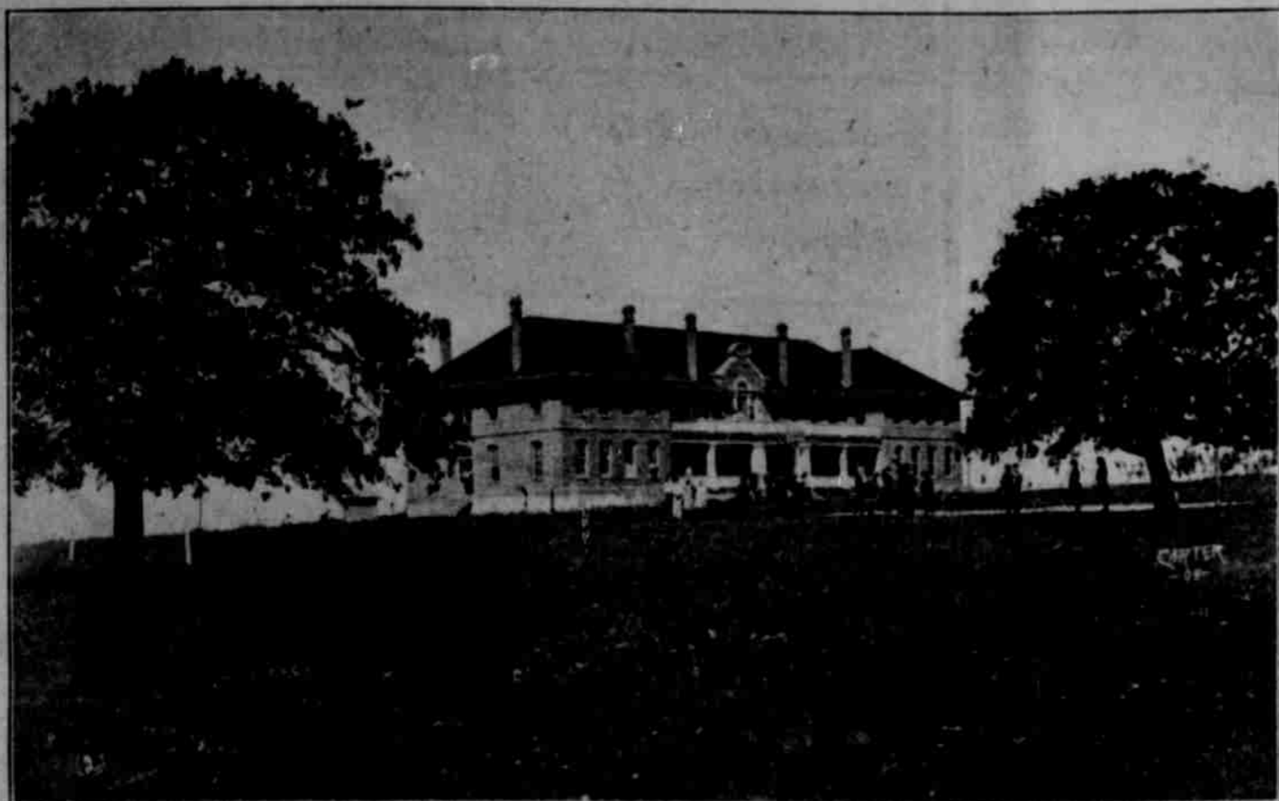
Bryan Baptist Academy—Girls and Young Ladies Prepared for Colleges and Universities.