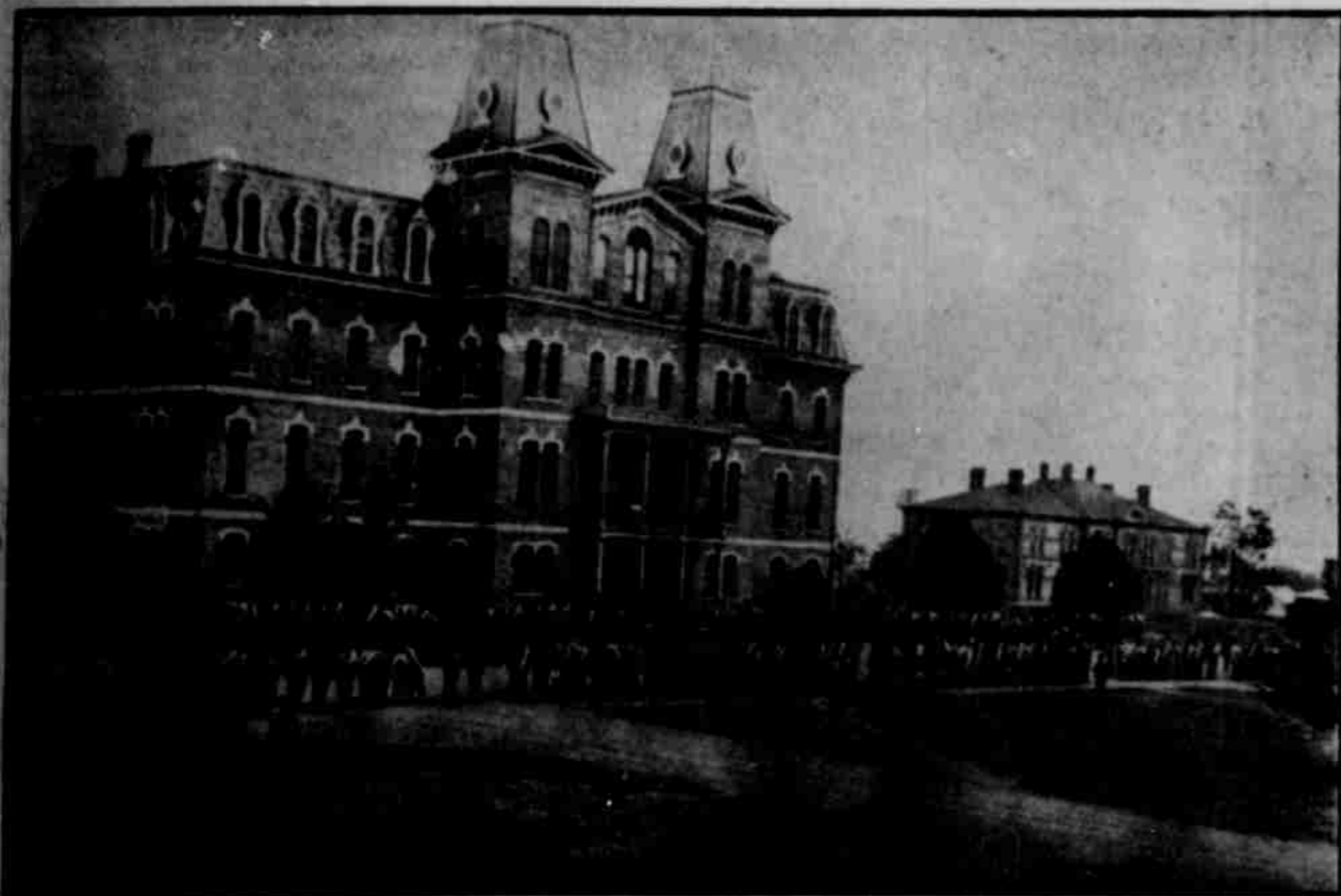
A. & M. College of Texas—The Leading School of the South in Scientific and Technical Training.