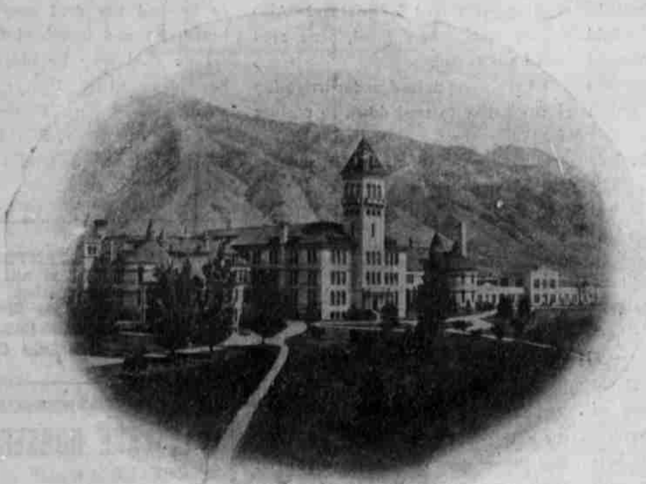
Group of Main Buildings