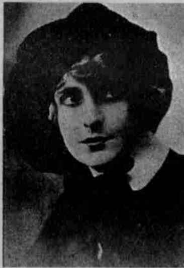
MISS PEARL WHITE, THE DARING STAR OF "PEARL OF THE ARMY" THE PATRIOTIC SERIAL WHICH IS BEING SHOWN AT THE ORPHEUM THEATRE EVERY SUNDAY, MONDAY AND TUESDAY, AS A FEATURE OF THE PHOTO-PLAY BILL.