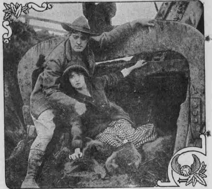
ONE OF THE BIG SCENES FROM "OVERALLS", THE FIVE-ACT MUTUAL PICTURE WHICH WILL HEAD THE BILL AT THE REX THEATRE ON SUNDAY, MONDAY AND TUESDAY