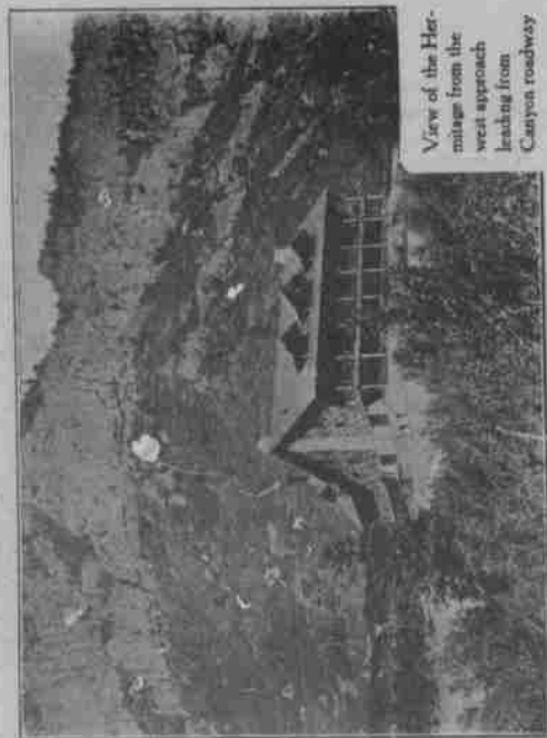
View of the Hermitage from the west approach leading from Canyon roadway