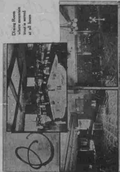
Dining Room where mountain trout is served at all hours

Fifteen Minute Car Service to Mouth of Canyon. Busses and Autos Meet All Cars