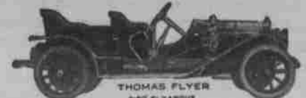
THOMAS FLYER 6-60 FLYABOUT $4,500.00