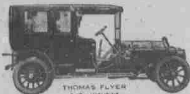
THOMAS FLYER 6-60 LIMOUSINE $7,500.00