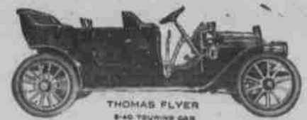
THOMAS FLYER 6-40 TOURING CAR $3,000.00

We will receive three of these cars April 10th