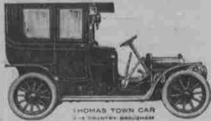
THOMAS TOWN CAR 2-DOOR BODY BRUSHAM $3,000.00