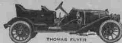
THOMAS FLYER 6-70 FLYABOUT $6,000.00