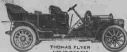
THOMAS FLYER 4-60 TOURING CAR $4,500.00