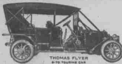
THOMAS FLYER 6-70 TOURING CAR $6,000.00

We will have one of these cars in our salesroom about April 5th