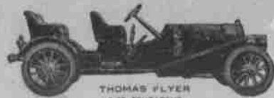
THOMAS FLYER 6-70 TOURABOUT $6,000.00

THE CAR THAT BEAT THE WORLD'S BEST CARS FROM NEW YORK TO PARIS BY 26 DAYS