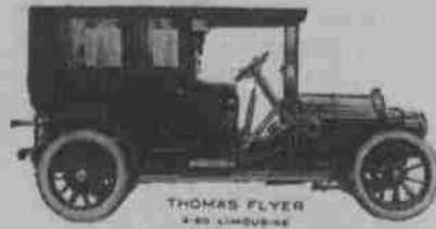
THOMAS FLYER 4-60 LIMOUSINE $6,000.00