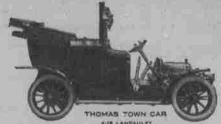
THOMAS TOWN CAR 4-DOOR CARRIAGE $3,000.00