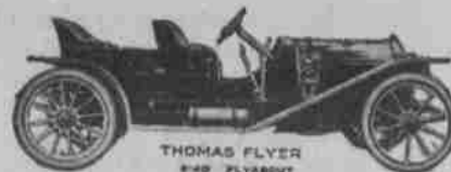
THOMAS FLYER 6-60 FLYABOUT $3,000.00

We will have one of these cars in our salesroom about April 5th