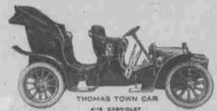
THOMAS TOWN CAR 4-18 CARRIAGE $3,000.00

We will have one of these cars in our salesroom about April 5th