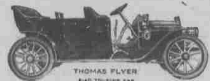
THOMAS FLYER 6-40 TOURING CAR $3,000