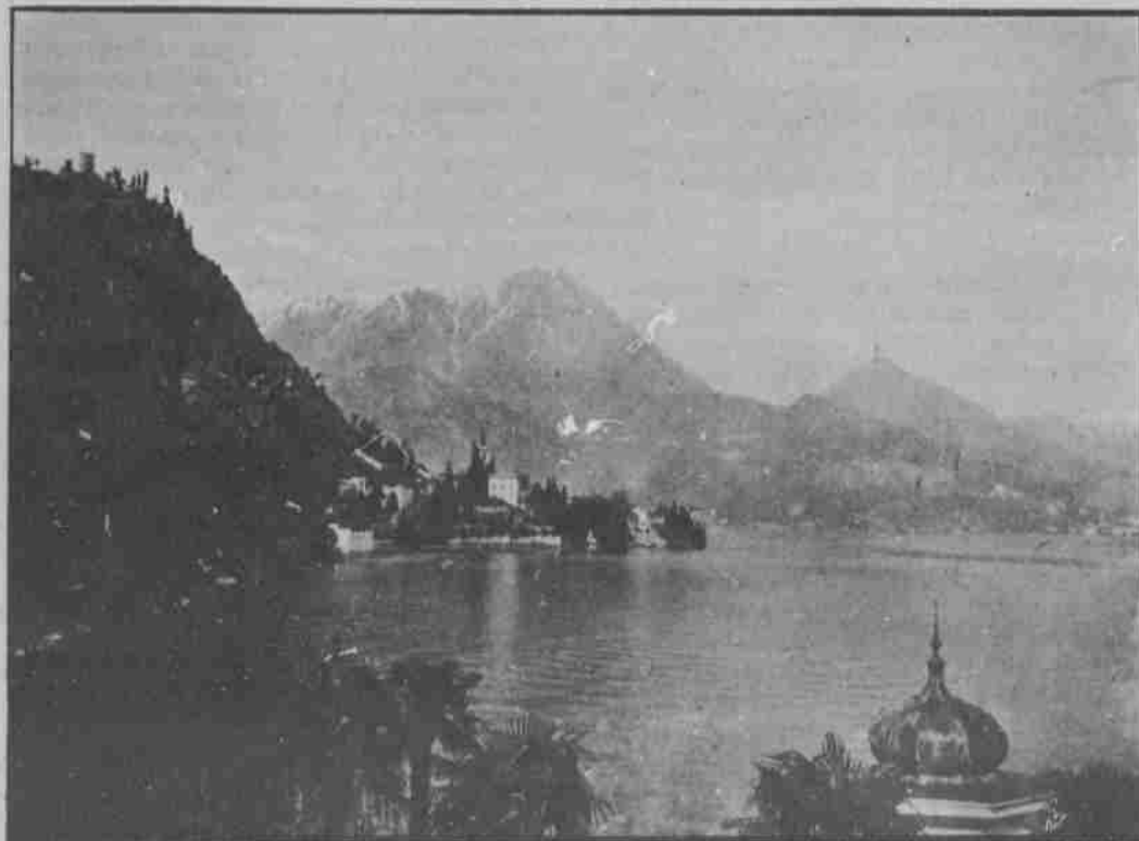
View of Lake Como from Varenna, with the Alps in the distance.

The party crossed the Alps through the Brunig pass through two feet of snow. This is the pass kept open by the soldiers the year around. The first day in France was spent at Gap, the party later going to Grenoble, the great glove manufacturing center, and from there to the