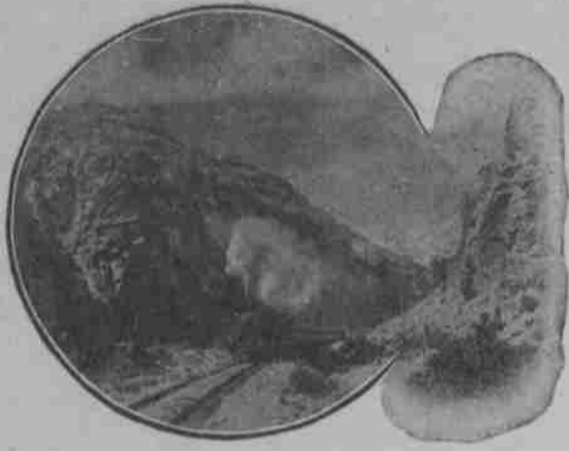
The Daylight Train Thro Rainbow Canyon. Lv. Salt Lake 11.50 P. M.