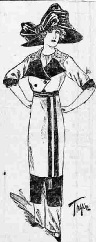
Cloth and Velvet Gown.

Trimnings of flowers, feathers, and smartest of all at the moment, bows of taffeta ribbon decorate the different straps.