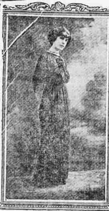
Embroidered Blue Liberty Satin Gown.

The newest models are quite novel. There are wide brims, but so flexible that they can be bent into the most becoming lines, caught up at one side, bent down at the other, bent back from the face or bent forward—whichever is the most becoming. There are small hats in toque and turban shape, but the larger shapes are the most popular. The crowns are smaller, consequently more becoming, and the head size is far more carefully selected.