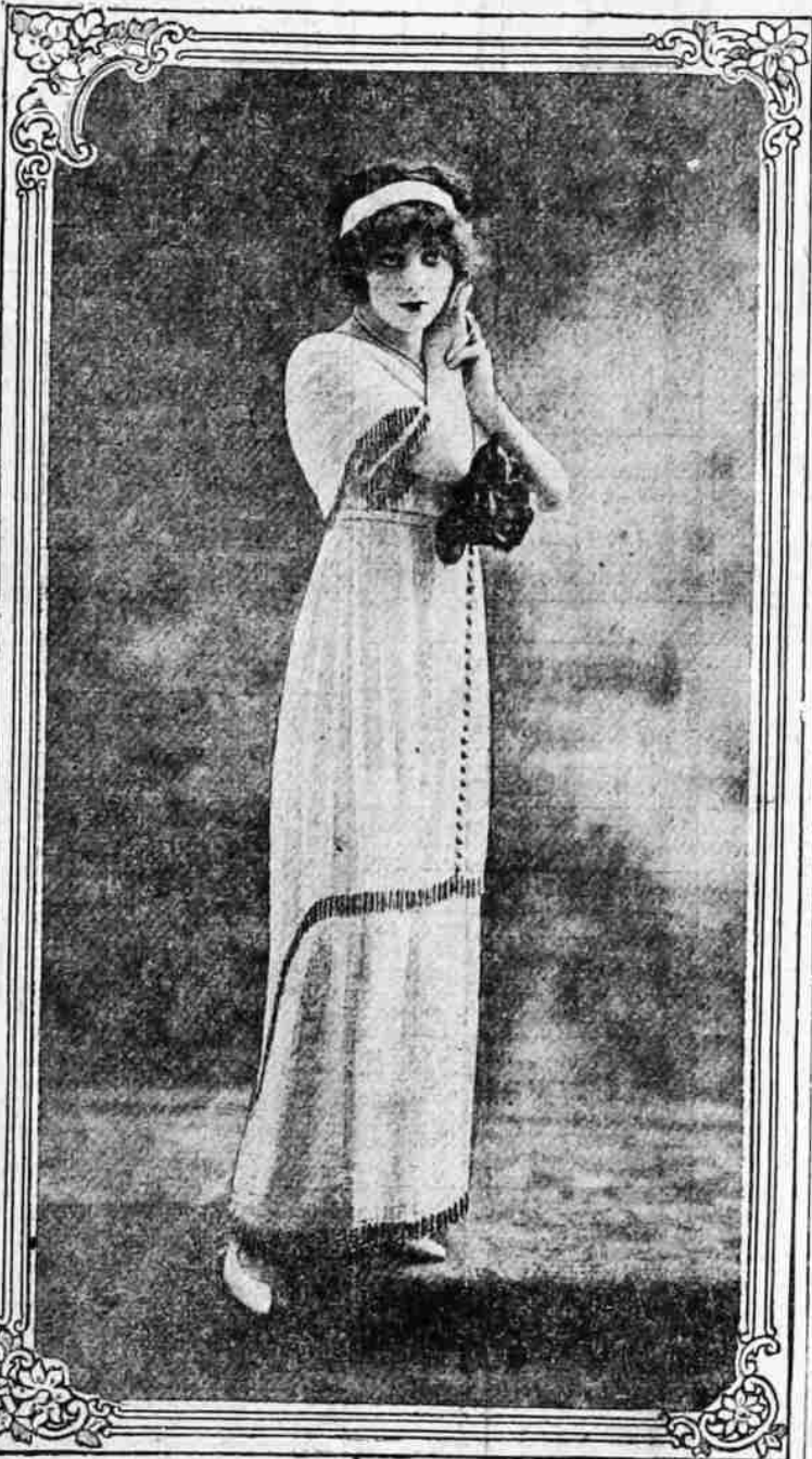
White Tulle Gown, with Gold Embroidery.

of figured design, preferably the Pompadour, with taffeta silk is one of the new fashions. This gives good results and is delightfully novel. For general utility wear the plain voile de mignous, both in dark and light shades and made up over India or foulard silk, have been proved so desirable that they will continue to be fashionable. For travelling gowns and for the occasional cool days they are so