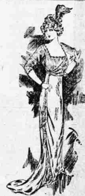
Pale Green Satin Gown.

THAT favorite implement of coquetry the fan is now restored to its former place of importance as a necessary and picturesque adjunct of the evening costume. In the opera box or at the fashionable dance the fan is most in order, and women who know the value of all such accessories are now spending much