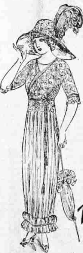
Embroidered Chiton Gown.

There are also black gauze fans trimmed with gold spangles or embroidery or with rather heavy trimming of braid, and these are most effective with certain costumes.