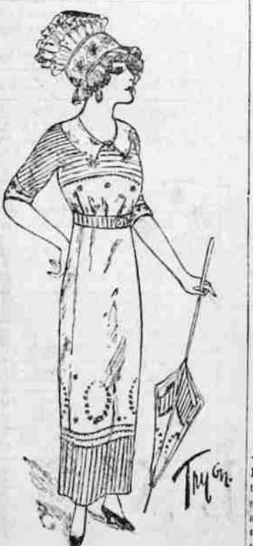
Embroidered Muslin Gown.

Voile de sole and all transparent materials will again be fashionable, but for the moment the silks of all kinds are the smartest. Combining the thin materials