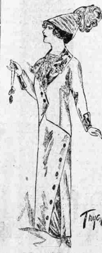
Taffeta and Satin Costume.

simplest and most expensive rather than conspicuous and less costly.