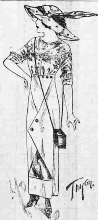
Foulard and Satin Gown.

Italian straw and the black fine straws are the smartest, but there are also colored straw braids that are adorable in shade and shape and, worn with the flowered muslins and silks, they will be most attractive.