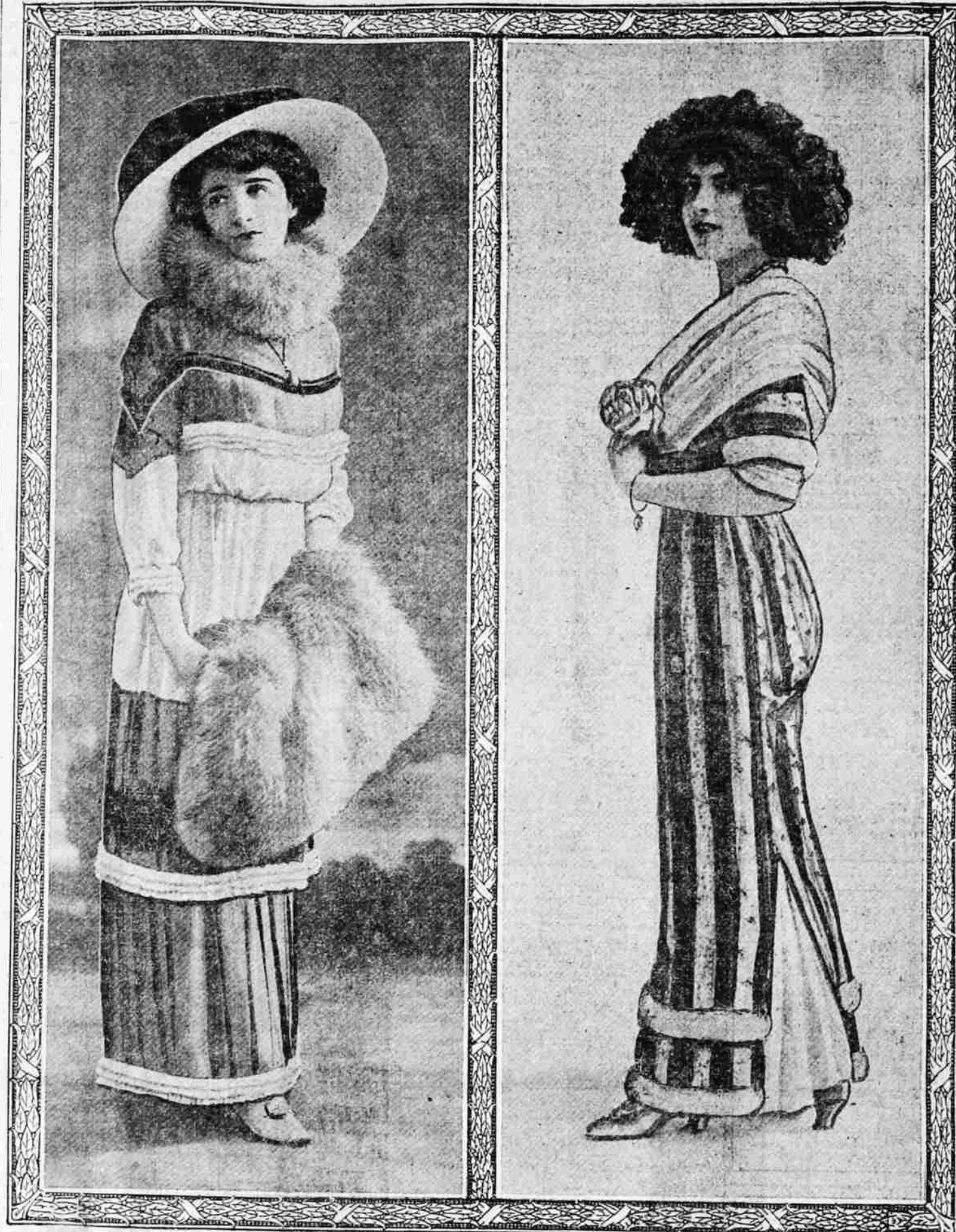
Black and White Mousseline de Soie Gown.