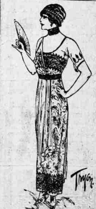
Spangled Dancing Frock.

More expensive than the ostrich fans, although not so effective, are those of exquisite and most valuable lace mounted on gold and ivory sticks, the latter being embellished with gold and jewels. These fans may be as valuable as one likes, for the gold sticks carved by hand may rep-