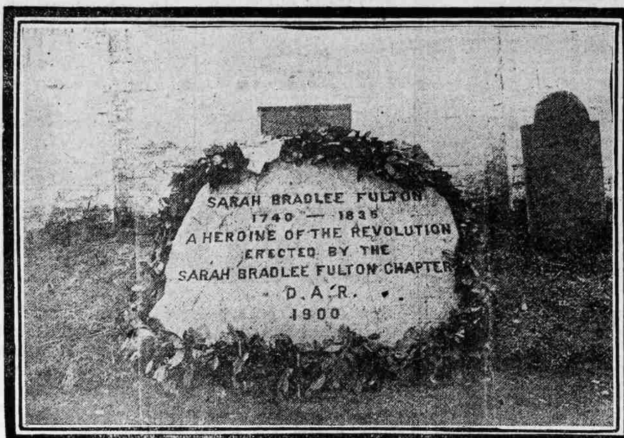
"OUR PIONEER MOTHERS."